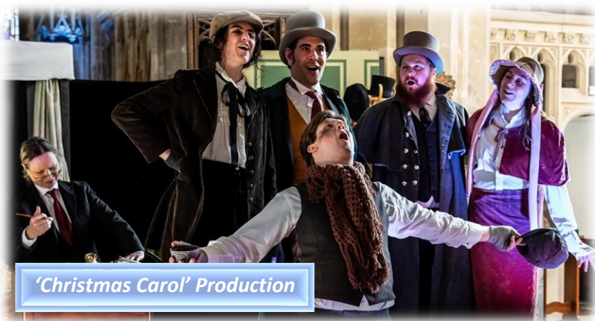
'Christmas Carol' Production