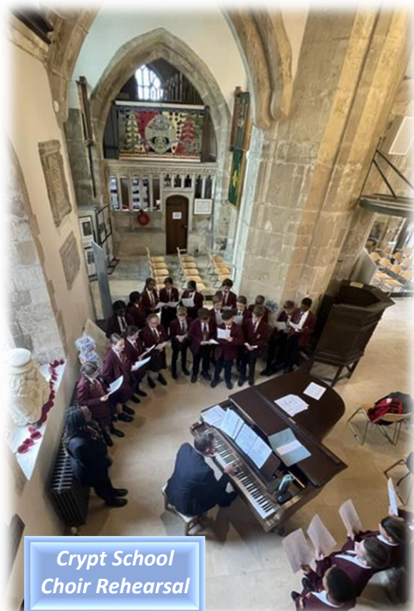
Crypt School Choir Rehearsal