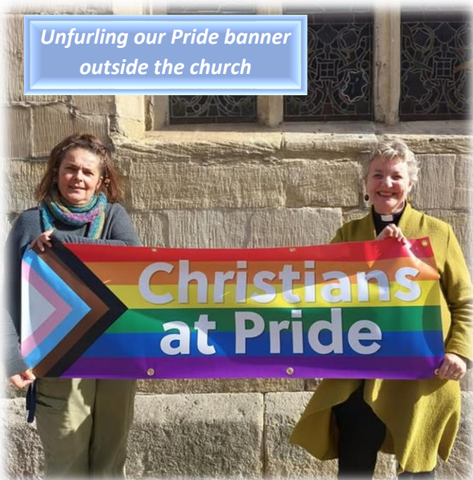
Unfurling our Pride banner outside the church