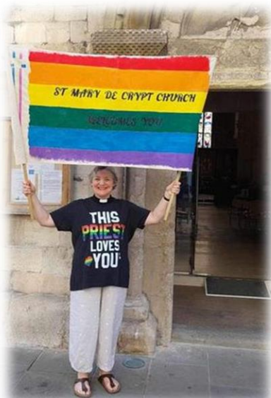
Canon Nikki with our Pride flag