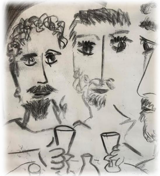
One of the 'Stations of the Cross'