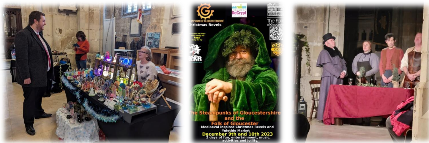
The Community Events: Viva Crafts, Steampunks and 'Great Expectations'