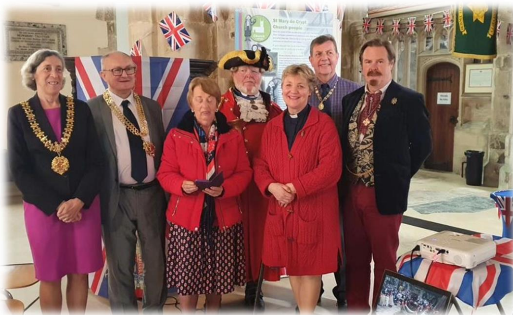
City dignitaries at Discover DeCrypt for the Coronation, May 2023