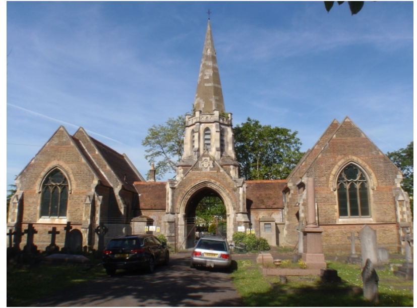
Above – Detail Views of new window grills and enhanced front of Main Chapel Building