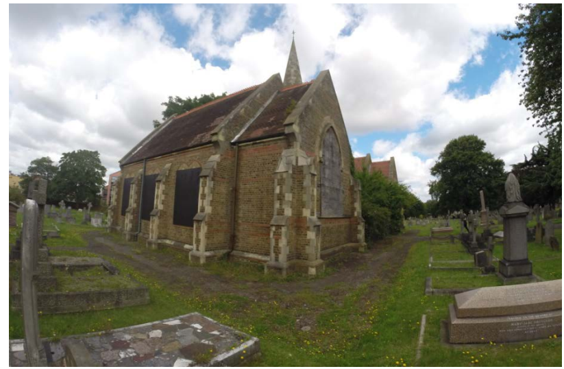
Above - Views of Main Chapel Building showing hoardings over windows as originally found