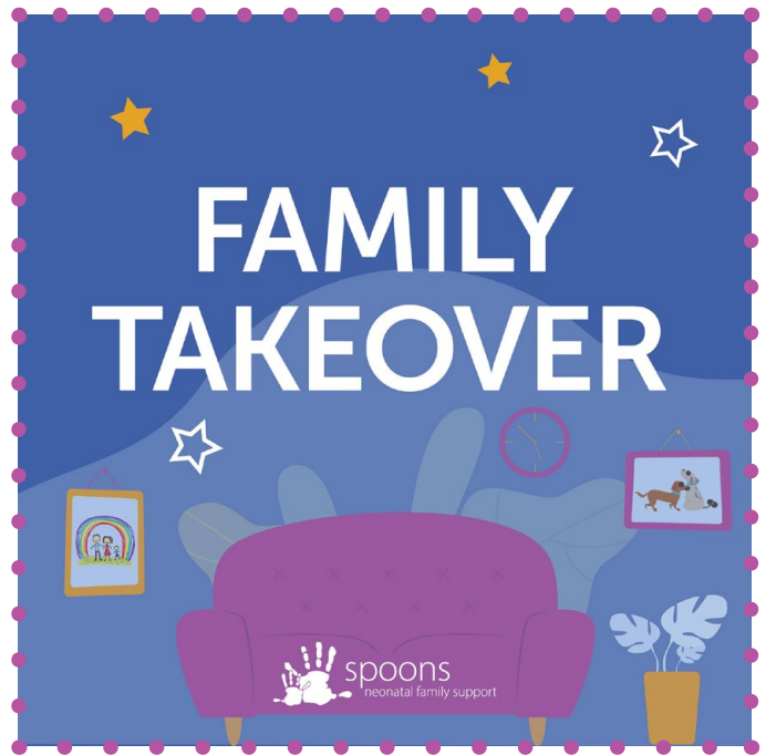
Our 'Spoons Family Takeover' social media campaign

In April this year we celebrated our fifth birthday with "Spoons Family Takeovers" across social media. This involved a number of the families that Spoons has engaged with over five years sharing what a day in their child's life looks like now. This was a huge success and we saw a significant increase in our digital footprint. More social campaigns are planned for the coming year to continue to drive awareness of our charity and the support we offer.