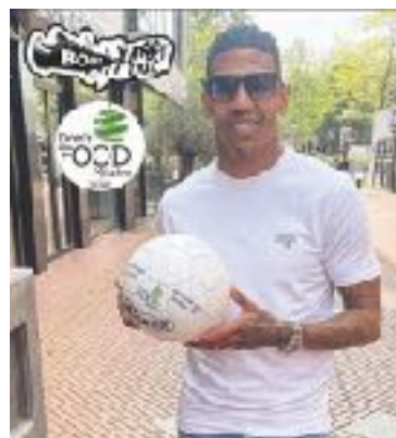
Patrick Van Aanholt