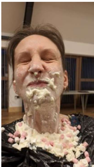
Wildfire pancake party and Go Wild!

Activities have included the ever popular 'nerf and chips' and pancake night when the poor leaders ended up wearing a considerable volume of marshmallows and squirty cream! A short message at each event encourages the young people to consider matters relating to the Christian faith. These meetings provide an important forum for young people to come together from across the churches and know that they are not alone in wanting to explore faith, as well as have some fun. We had about 20 young people attending each time.