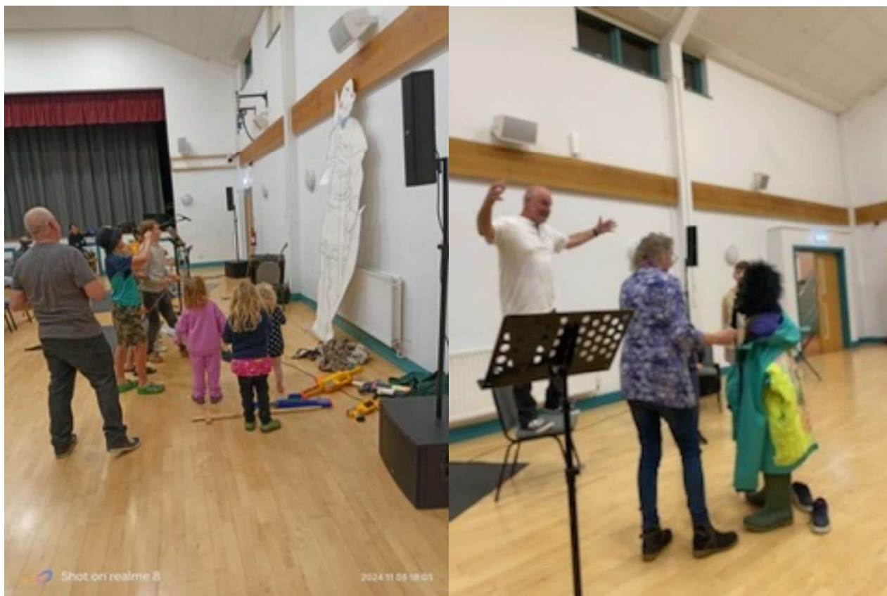
Slaying giants (on more than one occasion!)

Our children and young people's work is led by a member of our Leadership Team. We are very grateful to them and to the team of around 12 volunteers who help with the work. These individuals and other members of the congregation put considerable prayer and effort into each child and young person.