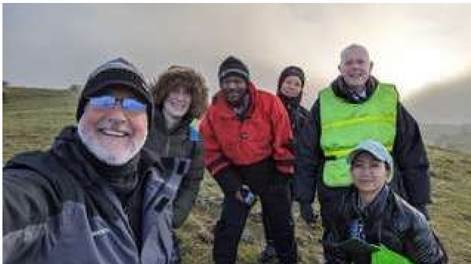
Easter sunrise 2024

This forum was set up to facilitate social interaction and invite people from outside the church to join us in a more relaxed environment. Events in the year consisted of meals, walks and games nights. A summer BBQ at Winterhead proved very successful as both an opportunity to personally thank our volunteers and to bring friends & family from outside the church.