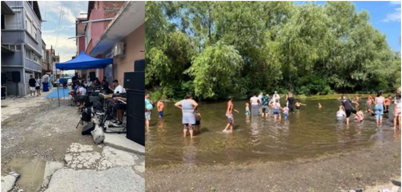
A street wedding and baptisms in Bulgaria

In 2024, the Charity was pleased to sponsor such visits to France, Turkey and Bulgaria. We expanded our support for Turkey by giving some financial support to a couple who have connections in the South West of the UK. This has facilitated in-person meetings with a wider section of the Charity. During a visit to Bulgaria, street weddings were a particular feature, together with a large number of outdoor baptisms.