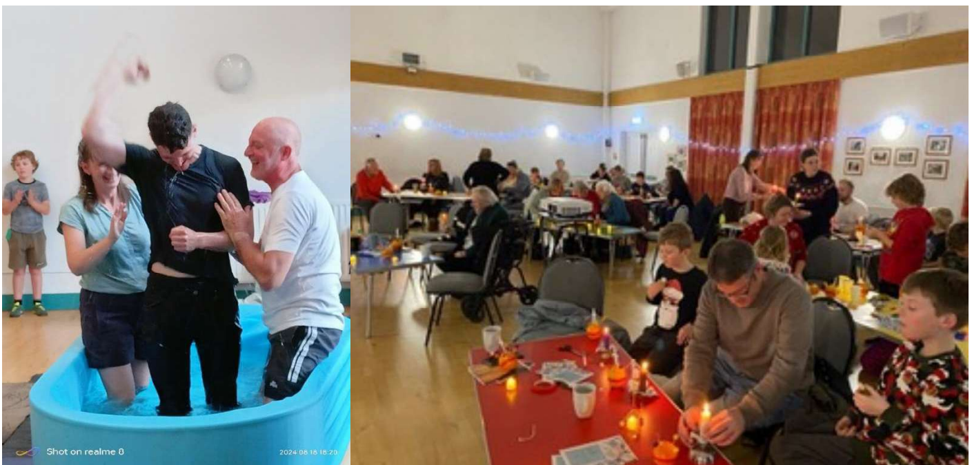
Our baptismal service and Christingle 2024

Finally, we particularly enjoyed the Christmas season when we were able to invite visitors to our Christingle and Carol services.