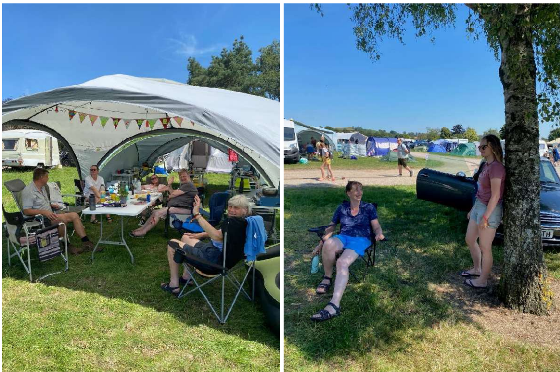
Enjoying fellowship at the New Wine Summer Festival

A small number of church members and their families also attended the New Wine summer festival. We were able to take time away from our busy lives to learn more about God. The festival also provided time to fellowship together and to have fun, especially as we were blessed with good weather this year.