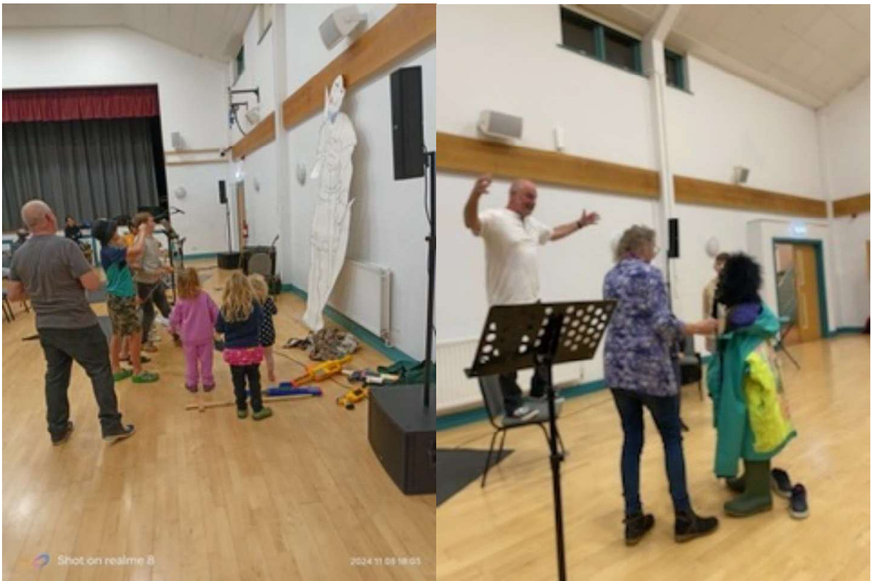
Slaying giants (on more than one occasion!)

Our children and young people's work is led by a member of our Leadership Team. We are very grateful to them and to the team of around 12 volunteers who help with the work. These individuals and other members of the congregation put considerable prayer and effort into each child and young person.