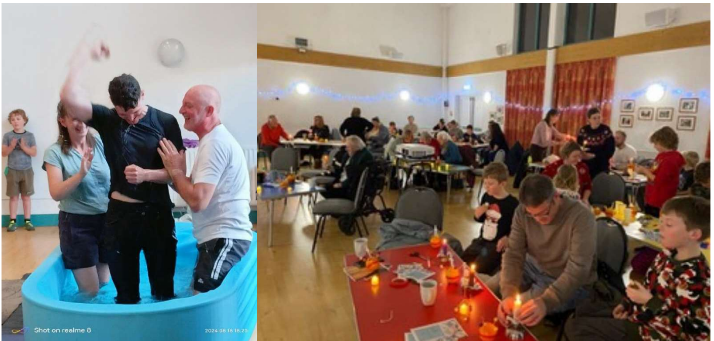
Our baptismal service and Christingle 2024

Finally, we particularly enjoyed the Christmas season when we were able to invite visitors to our Christingle and Carol services.