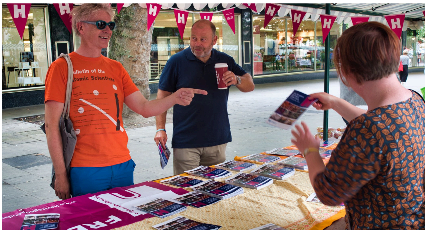
The HODs stall in the Promenade.

Heritage Open Days continue to inspire, enthuse and delight us. Twenty open venues (including six new ones) – a record number – hosted tours, exhibitions, musical performances and even heritage train journeys! They were joined by 18 guided walks, (including six new ones), self-guided trails, three plays and 21 talks.