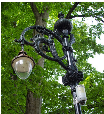
One of Minster Gardens' five recently restored 'Dragon and Onion' street lamps.

The Minster Mondays working group has already had a significant impact on the area's presentation and care. We look forward to maintaining a productive relationship.