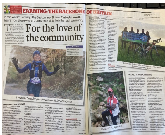
The Farmers Guardian Newspaper (2023)