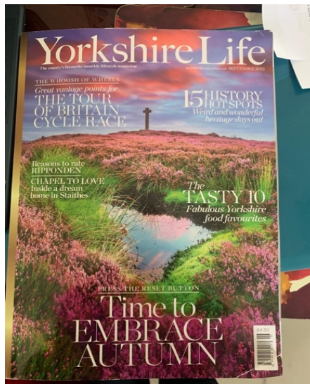
Yorkshire Life Magazine (2023)