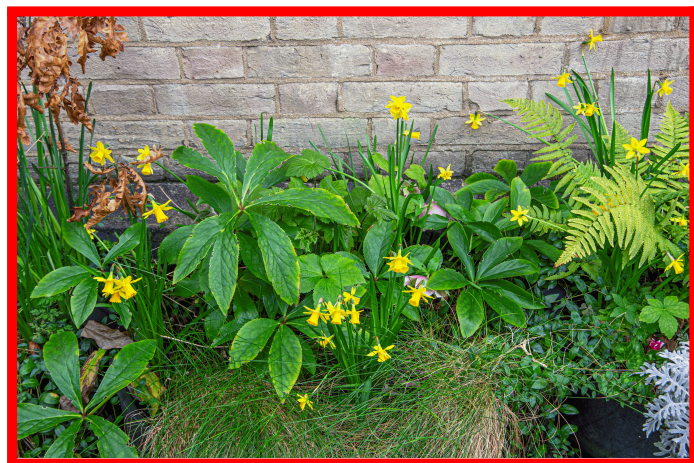
Daffodils in the Church Garden

We are happy to announce our collaboration with 'Garden Twinning'. We have 'twinned' our garden with another garden in Migori, Kenya, this means we are helping a family living in rural Africa with three years' training in sustainable organic farming.