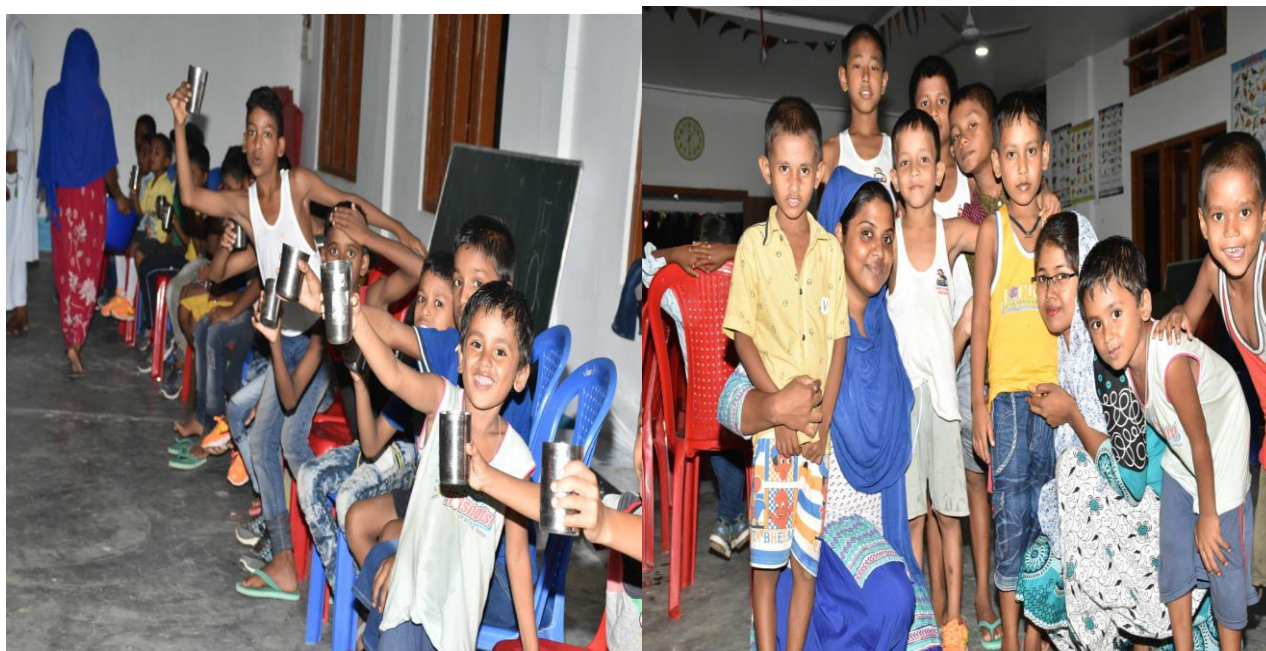
Boys at Orphanage

We are dedicated in providing support to orphans, widows and less fortunate regardless of race, culture or religion.