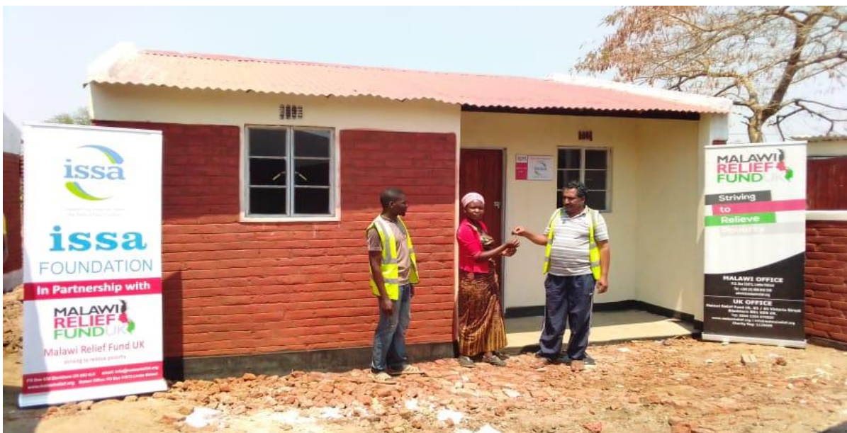
Shelter Programme Malawi

The current reserves are to be assigned to charitable projects as and when they have been identified, vetted and approved.