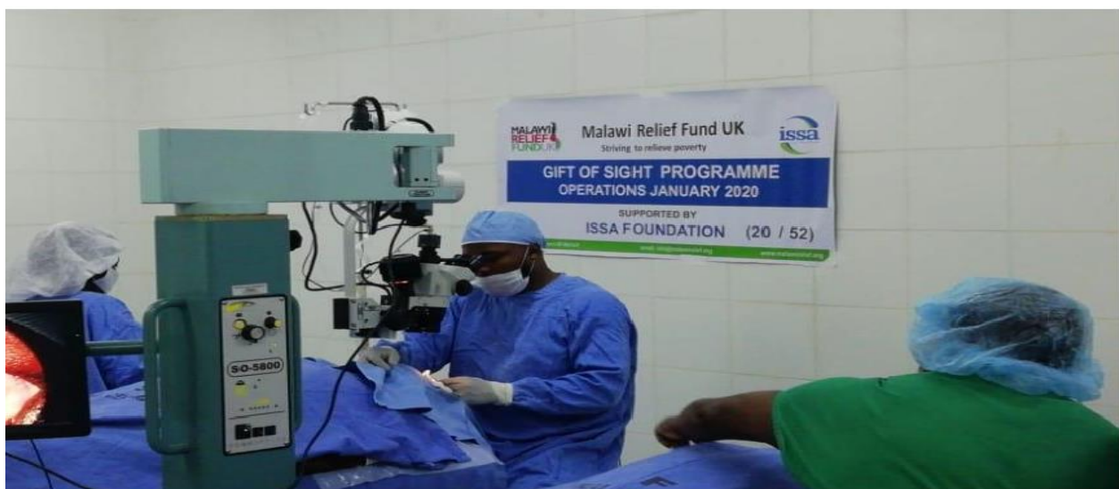
Gift of sight – Cataract Operation Malawi

Issa Foundation will carry on supporting local organisations here in the UK to support the most vulnerable in our communities.