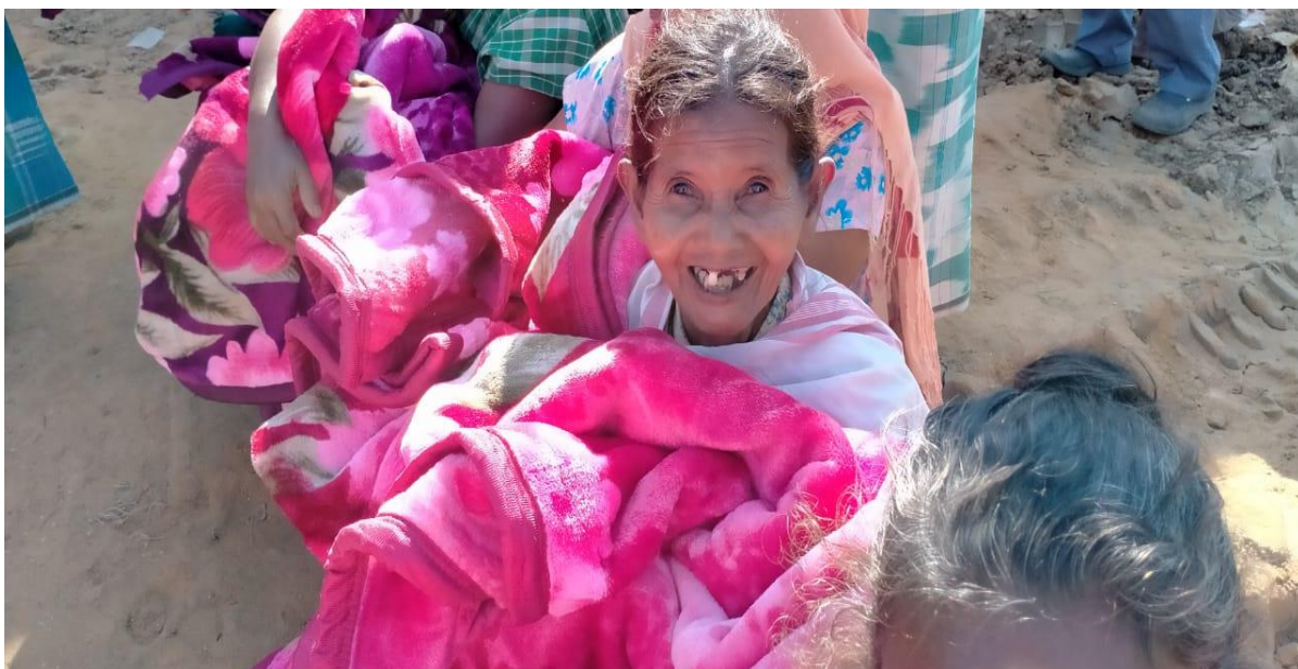
Winter Blanket Distribution