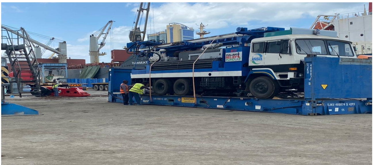
Water drilling rig being delivered in Malawi

The Trustees of Issa Foundation would like to thank all partners and volunteers for their support.