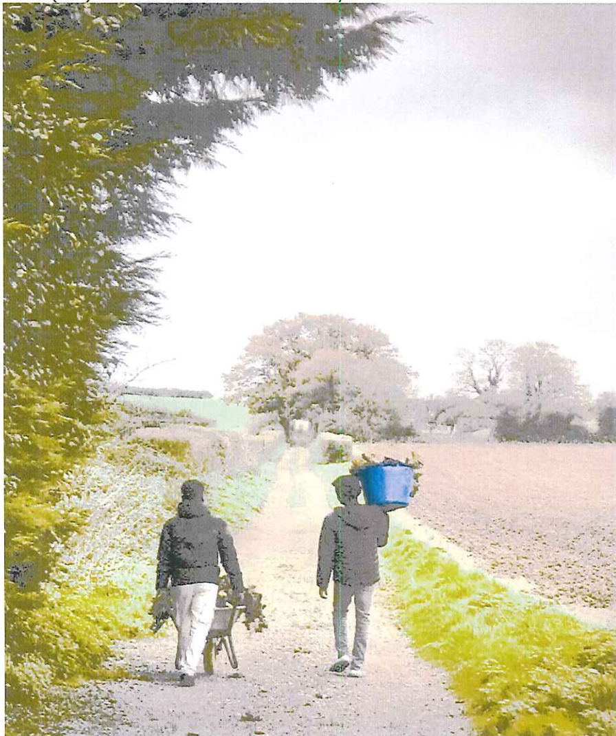
Members of the Youth Discovery Project on a community project on the South Downs

The Registered Charity Number is 1165796 and the charity is registered in England and Wales. It is a Charitable Incorporated Organisation (CIO) and was formed on 29th February 2016.