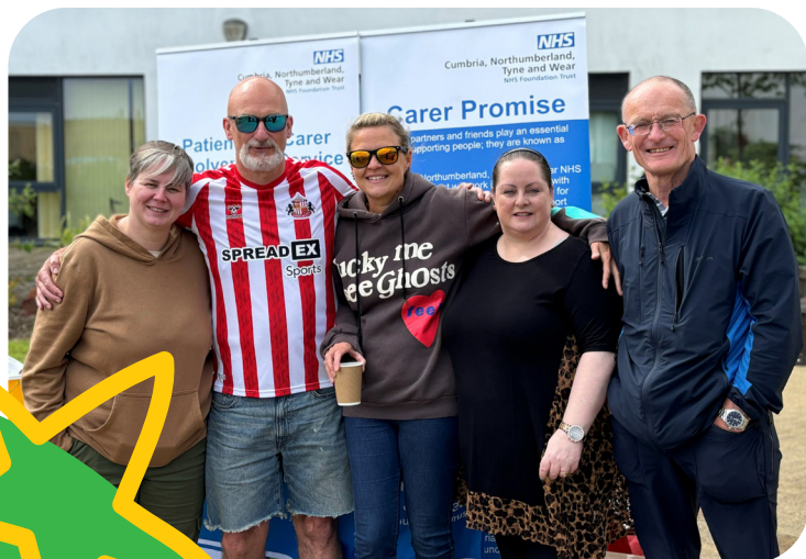
Social, Therapeutic and Recreational Rehabilitation Team (STARRT) , Hopewood Park, St. George's Park, and Mitford Unit for their hard work organising fundraising events and summer fayres.