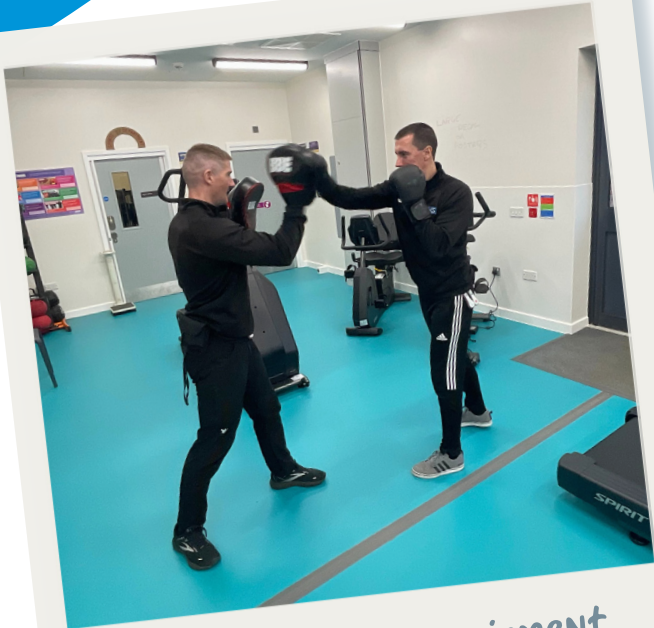
Sycamore sports equipment