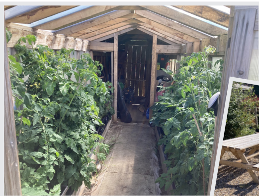
Forensic allotment group