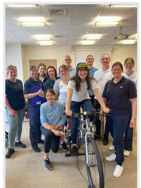
Cycle workshop at Walkergate Park

‘Its helped me fill my time doing something productive and peaceful at the community allotment.’ Feedback from patients