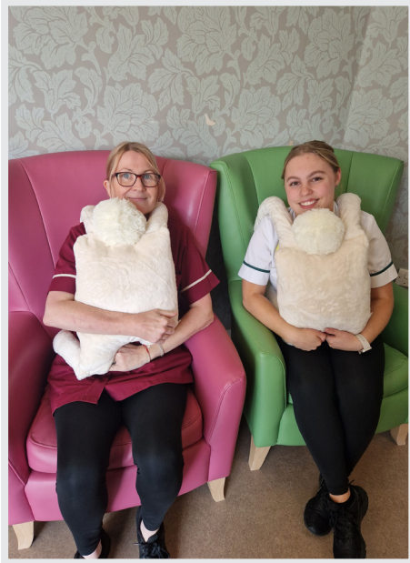
HUG therapeutic dolls at Carleton Clinic

Further examples of what the charity has funded this year.