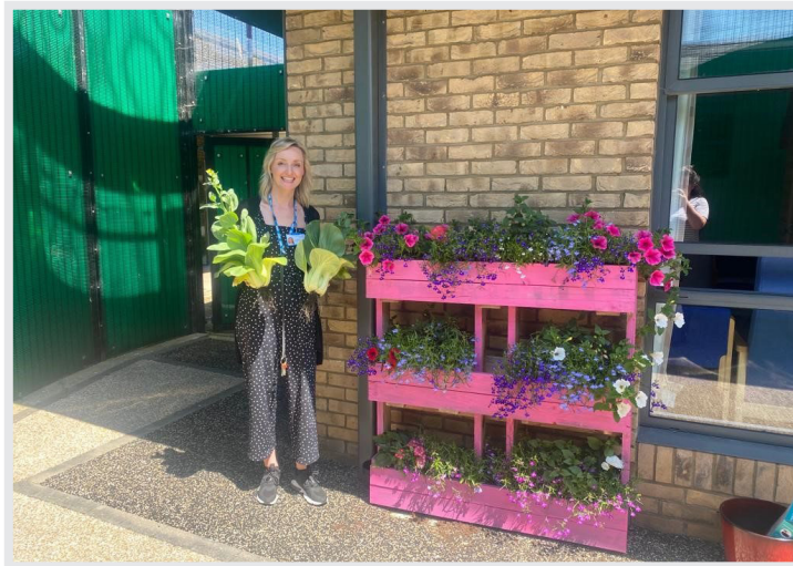
Therapeutic garden restoration at St George’s Park

‘I have observed patients find so much comfort from the hug dolls. The hug dolls have improved sleep quality for patients who have never slept alone apart from being in hospital. The soft warm pillow body is soothing with weighted limbs and a heartbeat to comfort patient’. Staff member - Ruskin unit