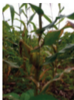
Mature Inga alleys Maize: 8 weeks 6ft 7ins Yield: 10 bags maize

The first crops planted in the alleys at Masarala were maize, planted at the start of the rains and harvested in August 2021. The results in our trial plots were impressive and showed that the maize harvest in the mature alleys was ten times that of the normal farming plot.