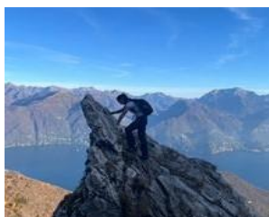
HOPE member after being with HOPE for 4 years.

A person or family's needs are individual and vary greatly even within one family group. Their relationship with the individual that has been killed, is what guides their traumatic grief. This can lead to light touch support, or intensive support over many hours and many months. HOPE is their constant, HOPE is there for them, through emotional, practical and family times of need; never judging.