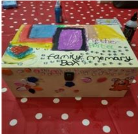
Memory box crafted by an 8 year old little boy.

Beneficiaries of HOPE have been supported to make a difference to their own lives and to those around them, also affected by a traumatic death. By coming along to a peer support group, families or individuals can engage, meet, and talk to others who have also suffered a traumatic bereavement. Not feeling that you are alone makes all the difference to just coping with the traumatic grief on your own. People are encouraged to create memory books, memory boxes, use crafting, and memory art, as part of their grieving process for their loved ones. HOPE also meets people at cafés or goes for a walk with people in the park, or visits people at home, alongside the Peer support groups