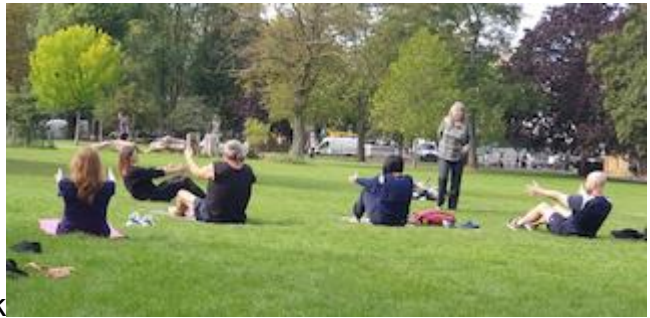
Pilates in the Park

a local take away shop until the weather deteriorated in September. The Wednesday event attracted 10-12 members each week.