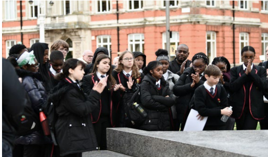
Visit at the Memorial

The programme concludes with a follow-up session at the Black Cultural Archives (BCA) and a visit to the Cherry Groce Memorial.