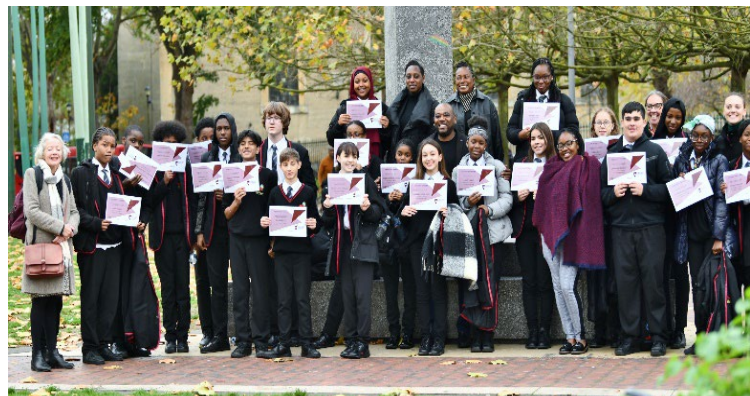
Memorial with achievement certificate

Schools Engaged: Lilian Baylis Technology Secondary School, Kings Avenue Primary School, St Helen's RC Primary School, Van Gogh Primary School.