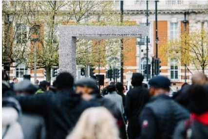
On lookers at the memorial