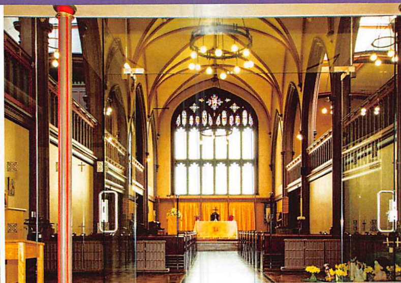
St Thomas' Church Pendleton