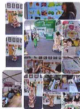
World Festival Day 2024

Family Boccia and Kurling indoor sports sessions were offered, giving families a chance to try out some new fun accessible sports. An earlier session was held in July with some hot competition in a men's v Women's Group challenge