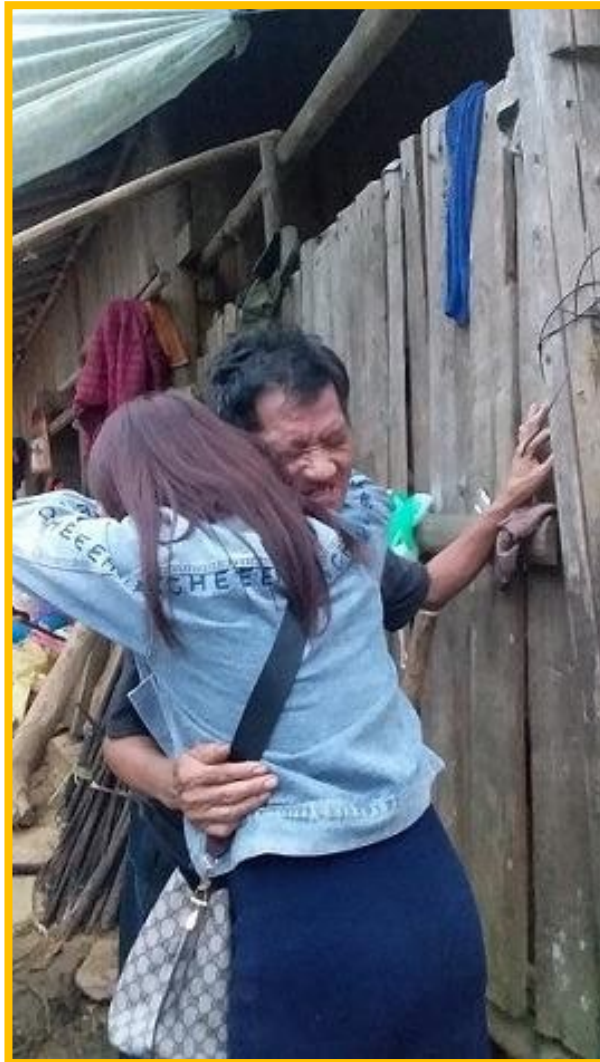
The emotional reunion of a young trafficking survivor with her father

Thanks to the donation of 29,713 GBP from Blue Dragon UK, Blue Dragon has been able to continue our mission to end human trafficking in Vietnam and provide exceptional care to street children and other children in crisis in Hanoi. This report summarises the highlights of the work Blue Dragon UK's contribution has made possible between January-December 2020.