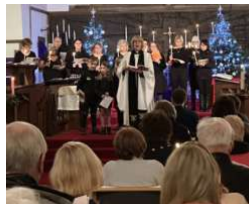
Christmas Carol Service

The overall feedback has been that the current mix of traditional and modern hymns and anthems sung in our regular services is appreciated by both the congregation and the choir.