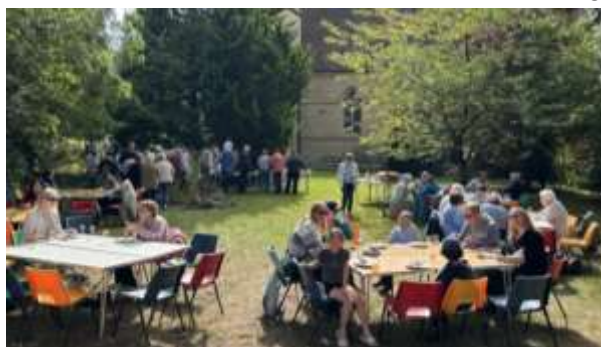
Parish BBQ in the Church Garden

December, as always, was a very busy month with events taking place every weekend up to Christmas. We provided refreshments for the Advent, Christingle and Carol services. We had our usual stall selling mulled wine at the Parish Council Christmas Market and organised the Parish Christmas Post Box.