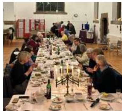
Holy Week Meal