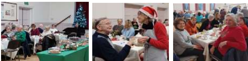
Christmas Afternoon Tea