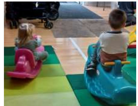
Pop-Up Café in the Hall

During the school holidays in August, we re-introduced our weekly Pop-Up Café on Thursday mornings for parents with children aged 3 years and under. This proved very popular with 15-20 children attending weekly. From discussion with parents and carers, we found out that August was a difficult month for those with very young children as all the toddler and baby group activities were closed for the summer and there was nowhere that mums and carers could go with their very young children. This meant that many felt isolated and lonely at this time. More holiday sessions will be arranged in 2025 providing enough support volunteers are available.