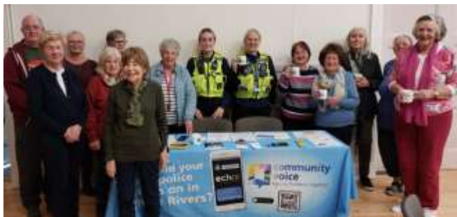
PCSO's visit Friday Cafe

Now in its fourth year, the Drop-in Café is ‘the place to go’ on a Friday where you can have a hot drink, from ‘excellent coffee!’, a range of teas and hot chocolate, and choose from a selection of home-cooked cakes or a toasted tea cake. But that is not its only purpose. Our light and airy Church Hall provides the space for Croxley Green locals, and beyond, to meet up with old friends and make new ones; to enjoy quality time to relax, chat and put the world to rights! It is also a place where, from time to time, we can speak to our Police Community Support Officers or our Parish Nurse. And we are even popular with dogs and their owners after a healthy walk.