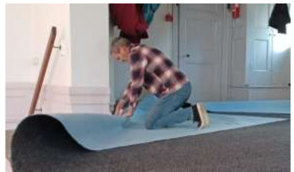
Laying new stage carpet

After all the work that was carried out in the main Hall during 2023, the Hall Committee decided to continue the programme of work to refurbish other areas. We wanted the entrance Hall to be a bright, warm, welcoming space so work was carried out in January to replace the radiator with a more efficient one, the area was redecorated to match the Hall and new lights, and a new notice board completed the job. New