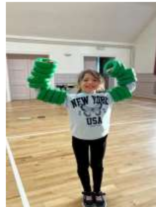
Members of the Youth Group enjoying games