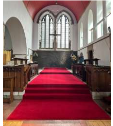
New Sanctuary Carpet