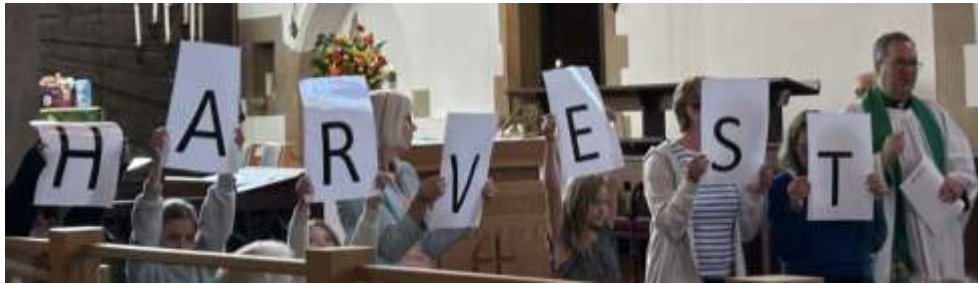
Harvest Service Talk Participation

with 45 minutes of quiet and peace in Church followed by a simple service of Compline. Led by our Pastoral and Evangelism Group, we continued to build on its existing ethos of intergenerational worship, encouraging children to grow in faith, understanding and engagement with worship by serving, reading some lessons, carrying the cross and taking up collections. Two sermons per month were made interactive, aimed at all ages. These services will be continued in 2025.