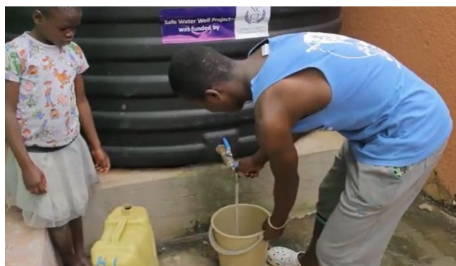
Clean drinking water from the new freshwater well and pump

Thanks to St James' Place Wealth Management and the Nobel Caledonian Charitable Trust we launched and completed our Safe Water Project. Clean accessible water continues to be a problem for many people in Bwaise; this project has enabled all of the children at our school and some members of the wider community to access clean drinking water. The knock-on effects of this on health and education are huge. The construction of the freshwater well at AFFCAD School takes us one step closer to sustainability. We are now looking into funding options for solar panels as a way to sustainably power our school.