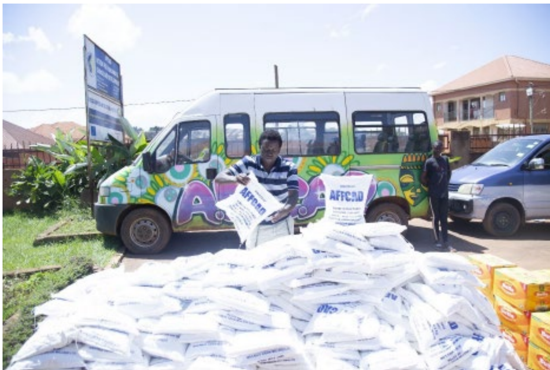
Food parcels being prepared for distribution by the AFCAD UG team

We completed a second distribution drive of food, masks and learning materials as part of the Covid-19 Relief Project. Later in the year the lockdown started to ease however schools and learning centres remained closed throughout the rest of 2020.