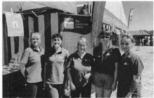
CPRE Staff team and volunteers at the New Forest Show 2024.

We have had numerous students come and volunteer on part time, time limited projects, bringing new ideas, energy and enthusiasm to the team. We have a regular 'office day' on Tuesdays in our office on the Sparsholt college campus.