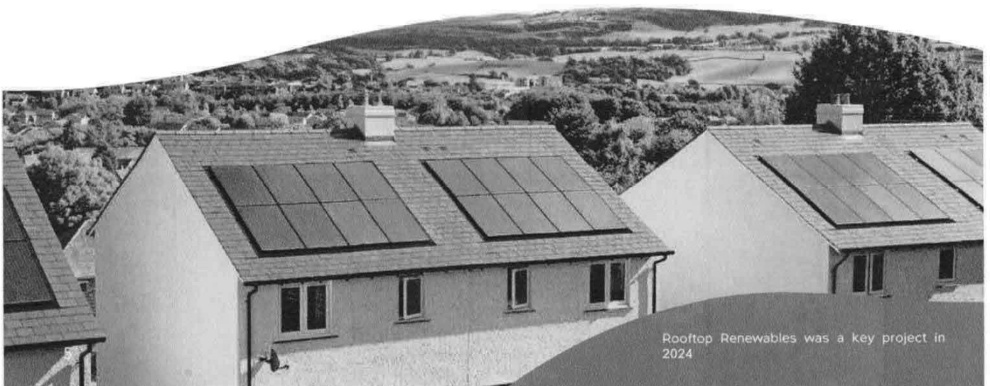
Rooftop Renewables was a key project in 2024

In June 2024 we held a conference with Southampton University attended by over 50 delegates, following the conference on the 10th Oct we held an online launch of our online map and policy brief to promote the rooftop renewable campaign across Hampshire & Sussex.