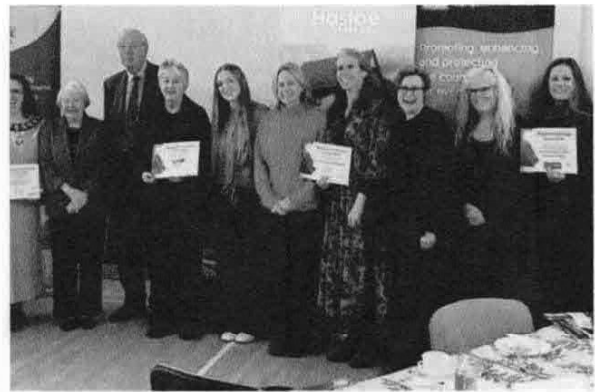
Countryside Award winners and funders 2024

A steering group with partners from the two National Parks, Sparsholt College, Tree Council, Winchester City Council and Test Valley Council meets regularly to support the project.