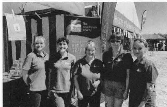
CPRE Staff team and volunteers at the New Forest Show 2024.

We have had numerous students come and volunteer on part time, time limited projects, bringing new ideas, energy and enthusiasm to the team. We have a regular 'office day' on Tuesdays in our office on the Sparsholt college campus.