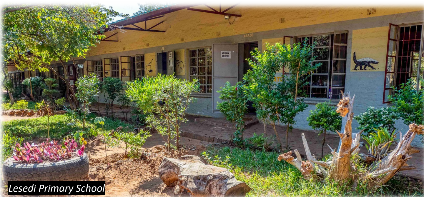
Lesedi Primary School

At the time of writing 280 children are enrolled at Lesedi Primary – 143 boys and 137 girls.