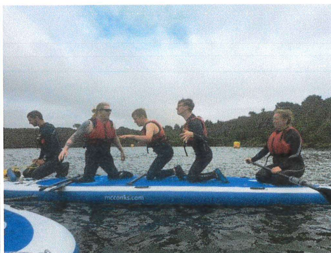
Image above, left shows: Illumin8 mentors at the mentoring training session.

Image above, right shows: Acceler8 members and their Illumin8 mentors teambuilding while paddleboarding.