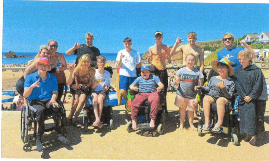
Image above: the 2021-2023 Acceler8 group at the beach.