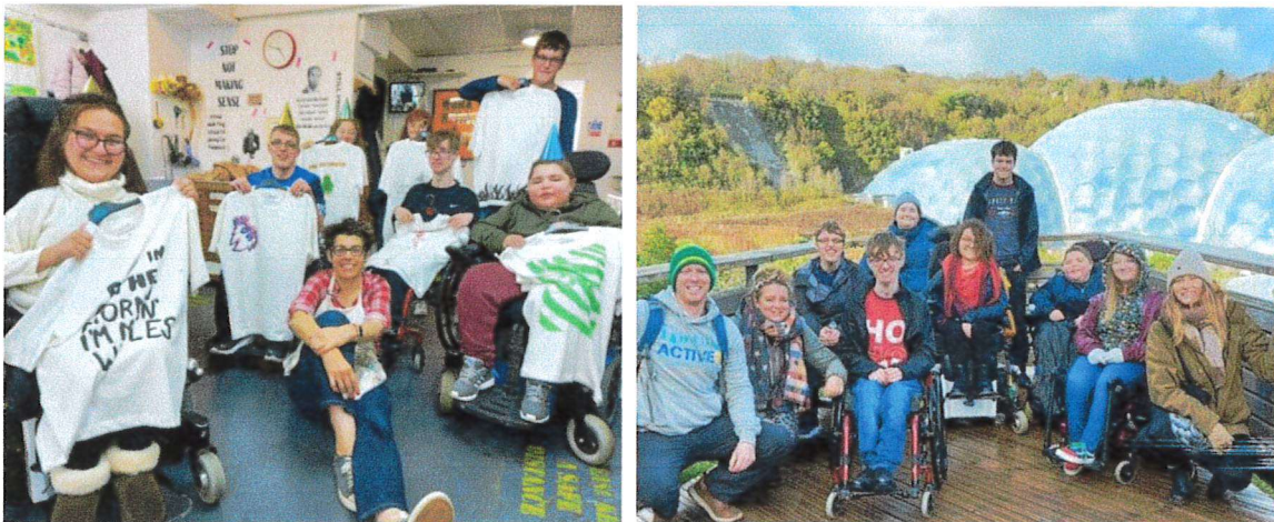
Image above, left: Acceler8 members holding up t-shirts they designed and screen printed.

Active8 have also arranged for members to take part in a local University Open Day so that they can begin exploring some of their post-16 choices.