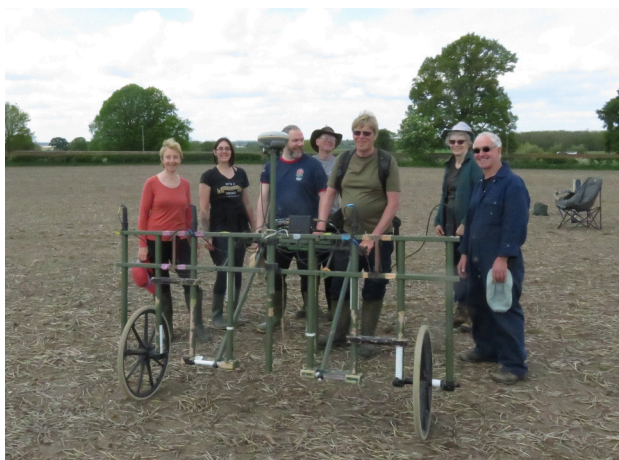
Volunteers on site near East Stoke, Nottinghamshire

The Roman A1 Project. The work on the early south-north road corridor in Yorkshire is now progressing southwards into Nottinghamshire. In spring 2024, RRA members along with local volunteers, conducted a gradiometer survey immediately south of the Roman settlement at Ad Pontem, which sits on the Fosse Way just across the R. Trent from Southwell, Nottinghamshire. The results, used as the cover image for this report, have proven the existence of RR59(x), another link in the chain of roads which, if we are right, would have formed a direct and essential line of communication from the provincial capital into the territory of the Brigantes at a relatively early stage in the Roman conquest of Britain.