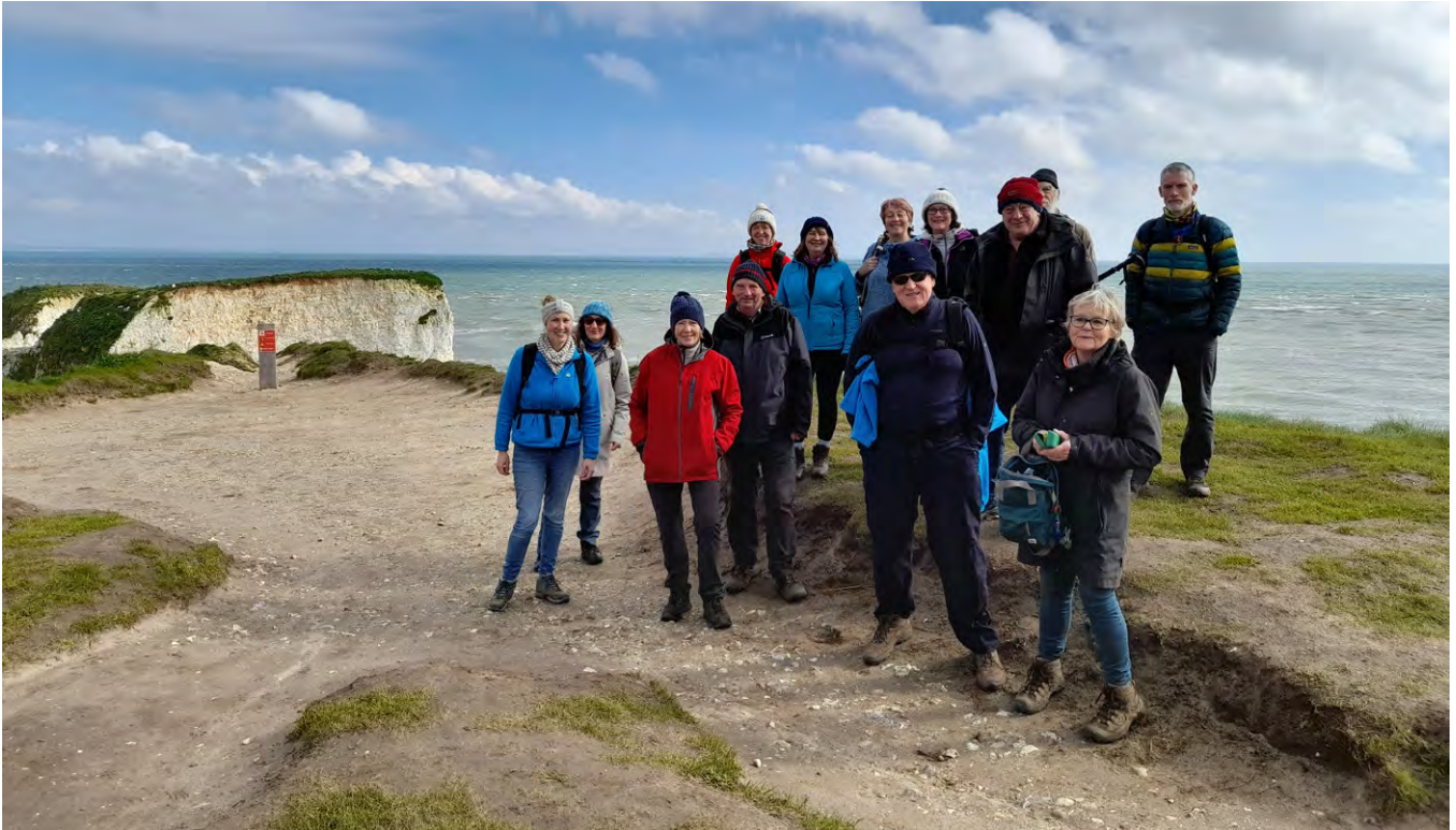
Dorset Coast Path Connectors, The Loft walking group at Old Harry Rocks