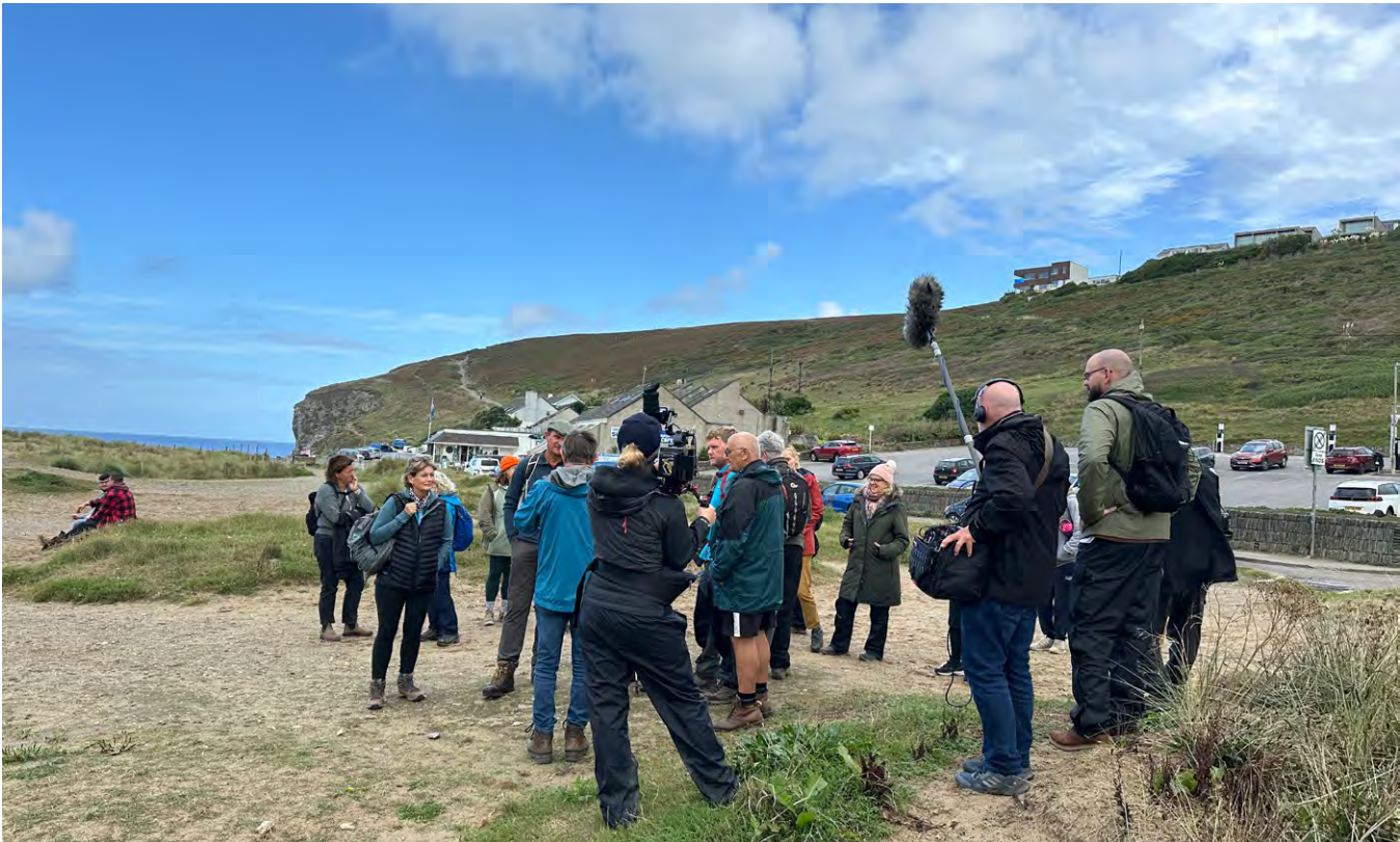
Filming with Countryfile, Perranporth, 25th September 2024