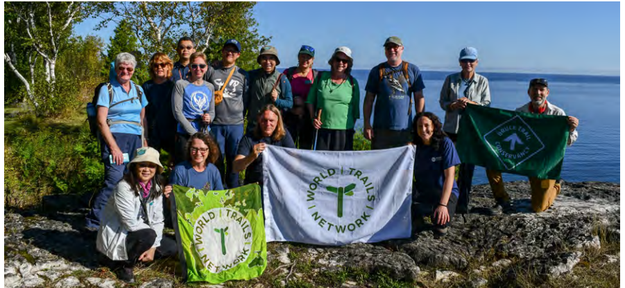
Bruce Trail and South West Coast Path Friendship Trail opening Canada

The Protected Landscapes Partnership continued to support the Coastal Wildbelt project with funding from DEFRA. A SW Pilot project was led by the charity working with National Trails UK to identify opportunities and barriers to delivery of this ambitious project to improve nature and people's access around the English coast. The Coastal Margin will deliver around 950 square miles of new open access land with over 10 million people living within 5km. Over 200k hectares of Coastal Margin have been identified as having the potential to contribute to our 30by30 biodiversity target, which equals around 1.6% of England and 71% of this area is made up of Priority Habitats including Mudflats, Coastal Saltmarsh, Maritime Cliff and Slope, Coastal Sand Dunes and Coastal and Floodplain Grazing Marsh.