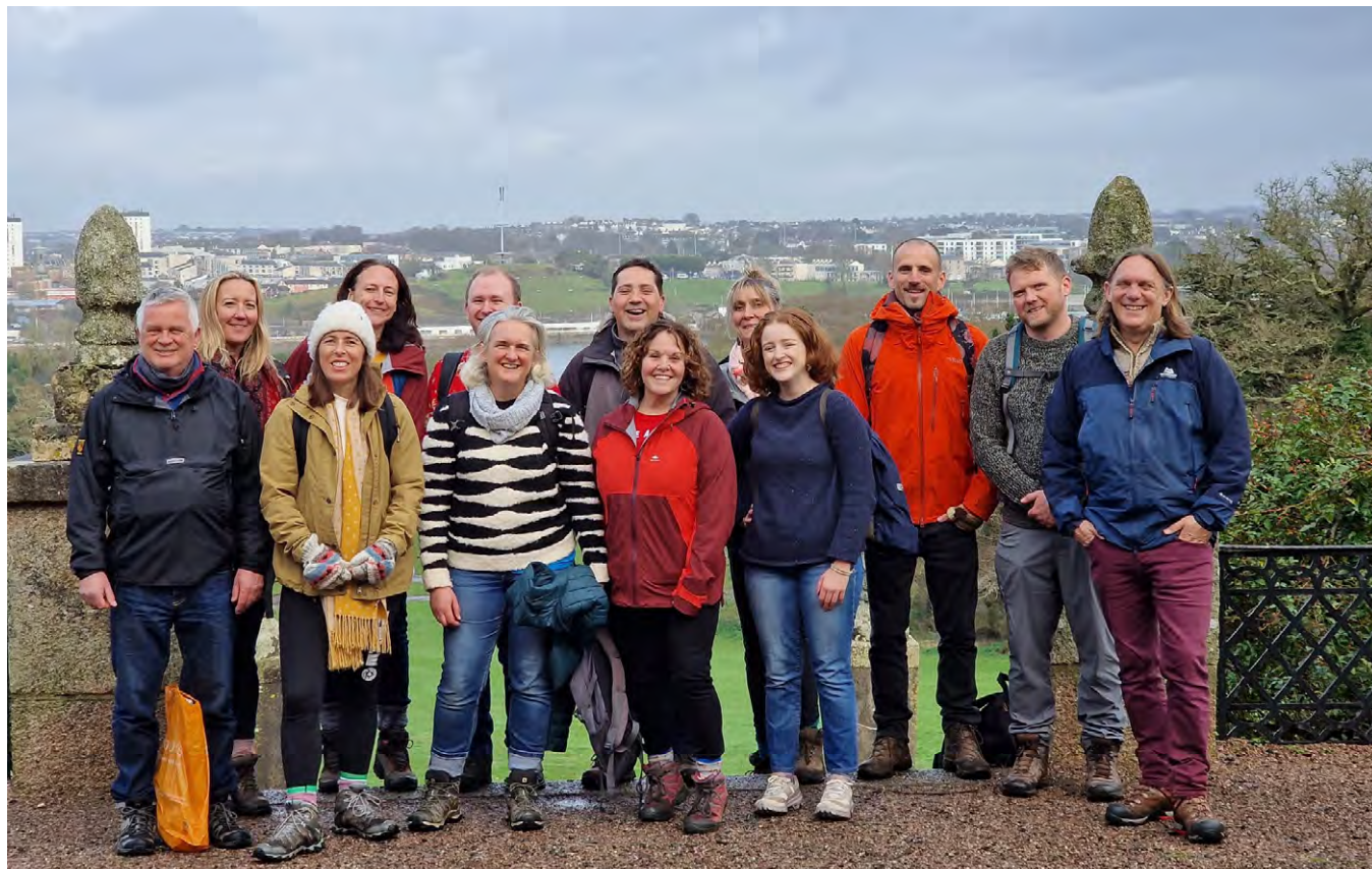
SWCPA Team Walk at Mount Edgcumbe

This 2024 Trustees Report has been structured to reflect the charity's work across these three areas.