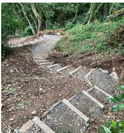
Mawnan Church Steps.