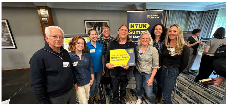
NT UK Summit