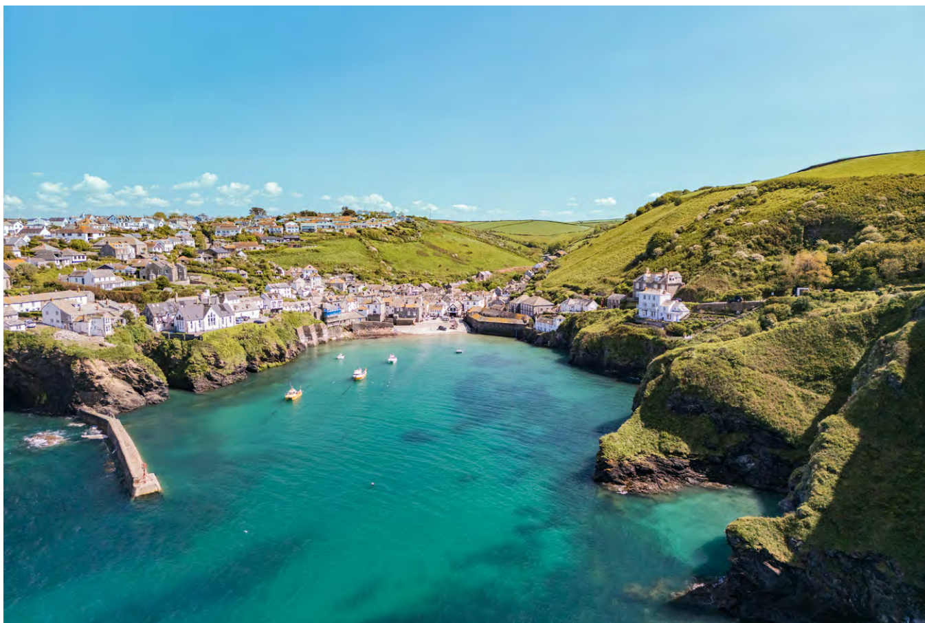
Port Isaac, North Cornwall.