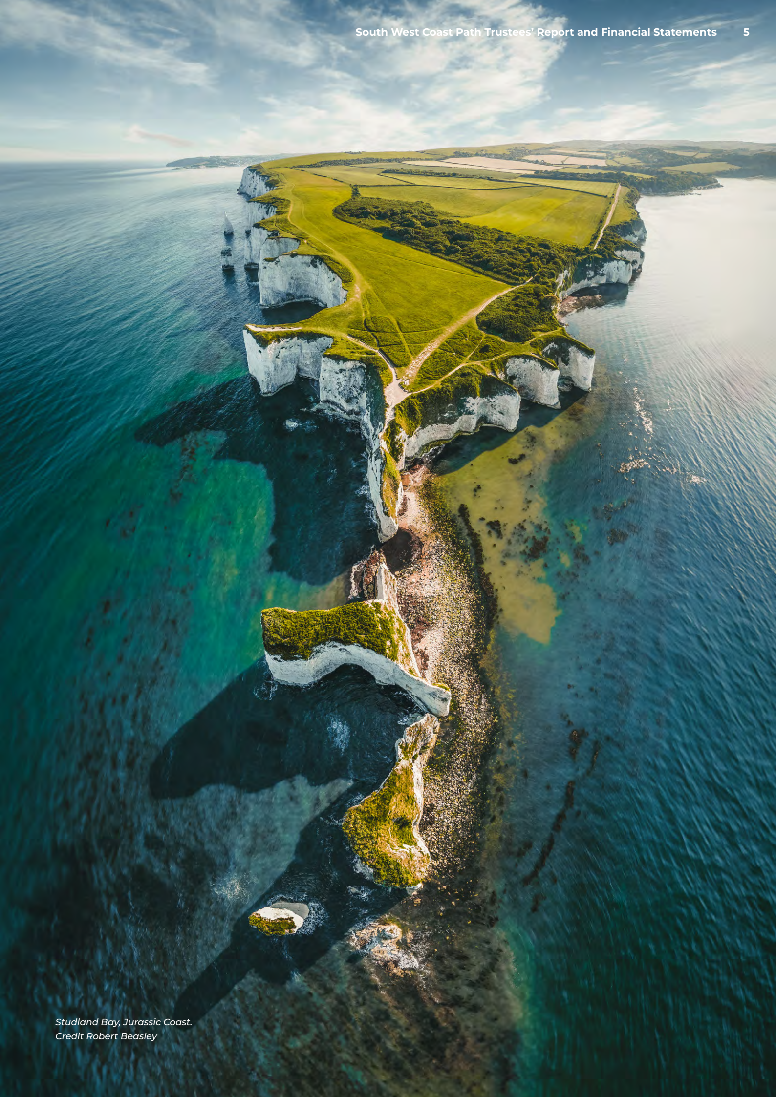
Studland Bay, Jurassic Coast.