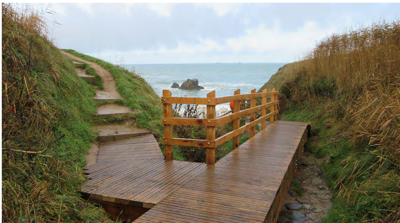
KCIII ECP improvements at Porthcothan.

We were successful in drawing in £156K from the KCIII ECP Establishment grant for refurbishment works to the iconic stairway at Royal William Yard which will be completed in early 2025. We received a further grant of £11k from Natural England to co-ordinate and produce signage and interpretation along sections of the National Trail in Cornwall. Information panels and plaques are being designed for estuary crossing locations to provide all options available, whether by ferry or showing the best route to walk around the estuary.