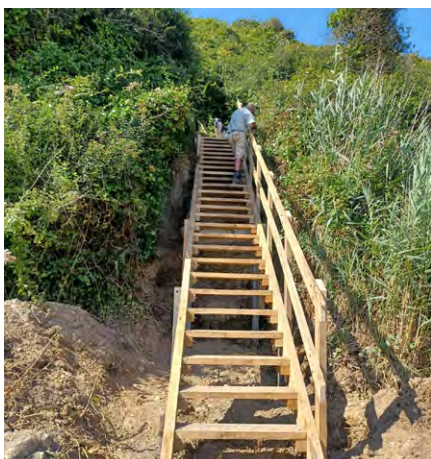
Portnadler Steps.