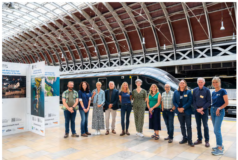
SWCP Photographer of the Year Exhibition at Paddington Station