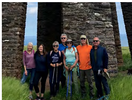
Coast Path Connectors Torbay, Brixham theatre volunteers at the Daymark near Coletton Fishacre

We also found out from our regular participants that: