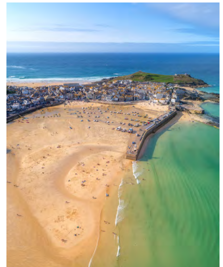
St. Ives, West Cornwall.