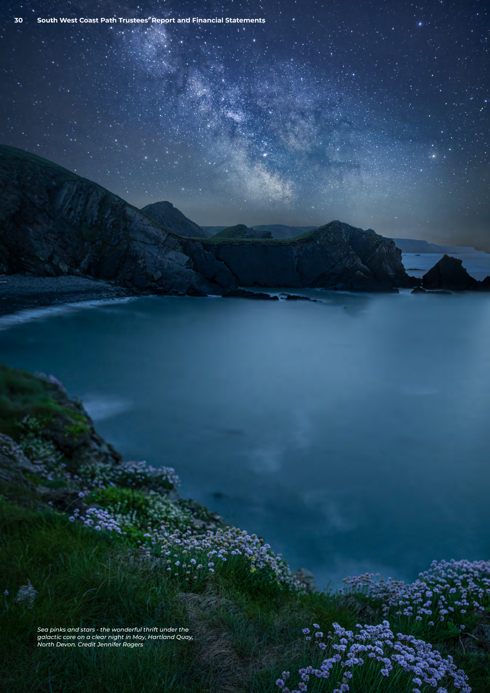
Sea pinks and stars - the wonderful thrift under the galactic core on a clear night in May, Hartland Quay, North Devon.