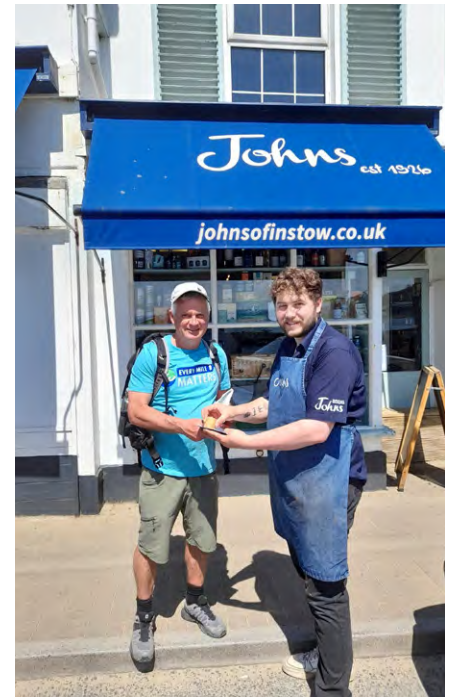
Stamping the Coast Path Passport in North Devon

Content on the website was updated throughout the year. In 2024 we posted 40 blogs that were viewed 20,695 times by 12,407 visitors.