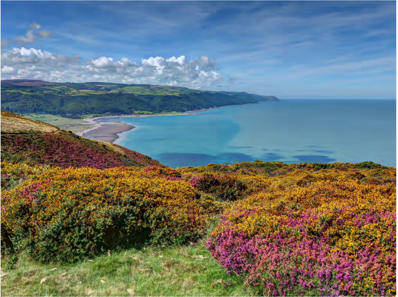
Bossington Hill, Exmoor.

We continued our support for the South Devon National Landscapes Life on the Edge project as well as the Tamar National Landscapes Tamara project.