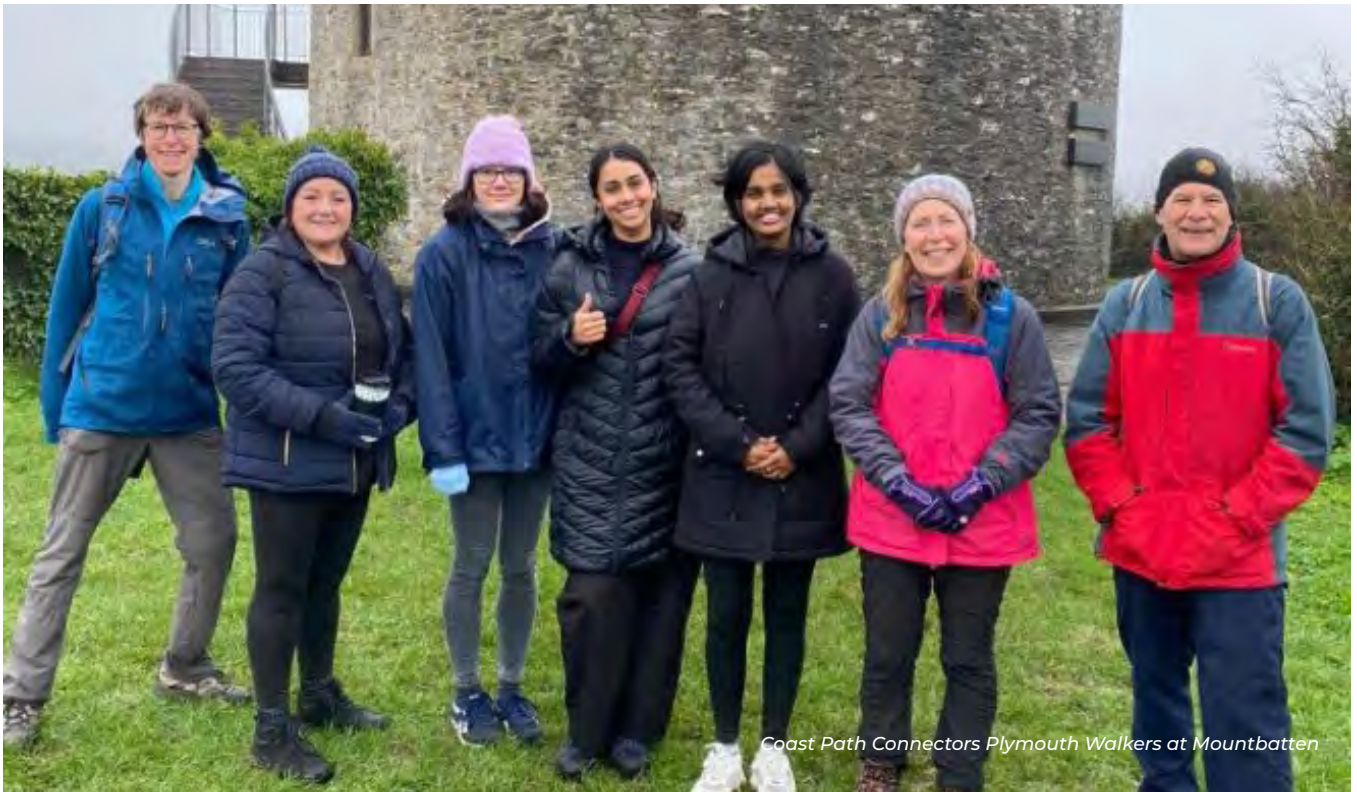
Coast Path Connectors Plymouth Walkers at Mountbatten