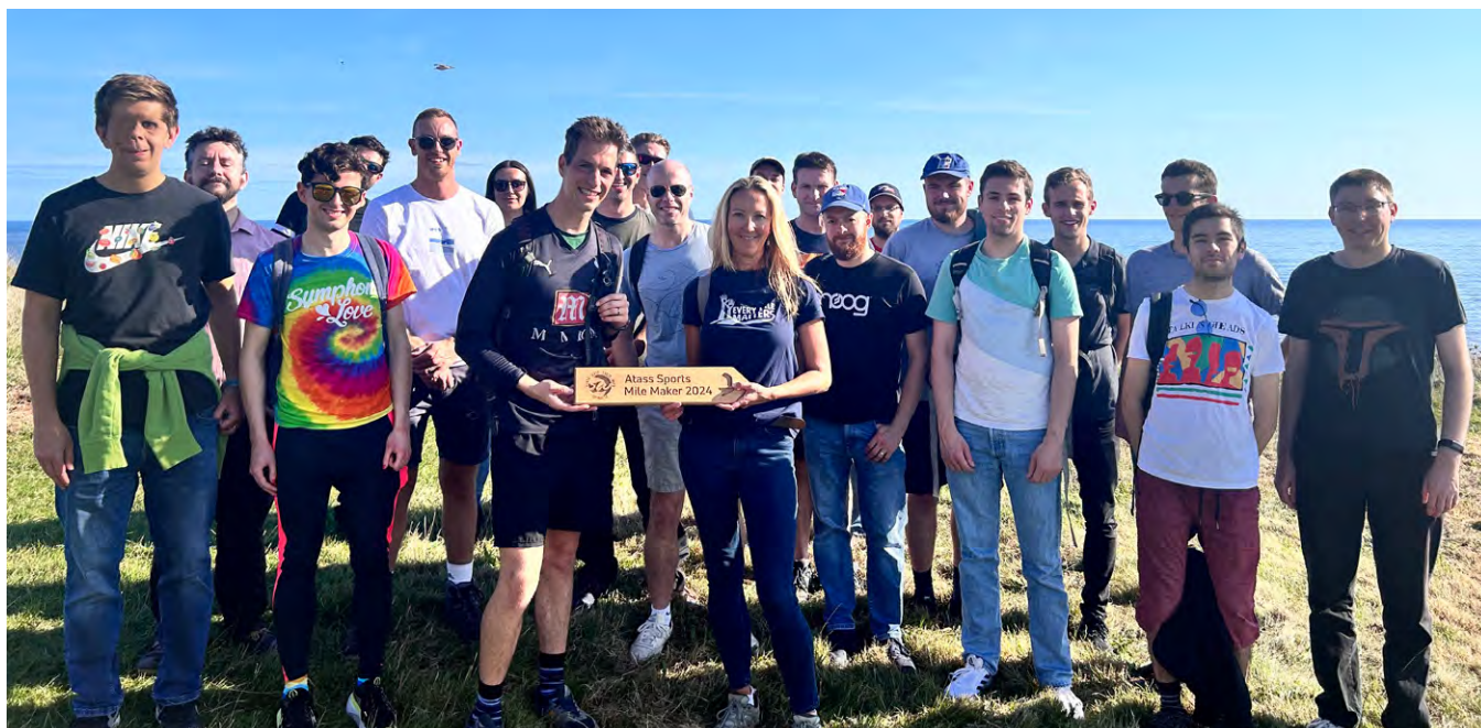
ATASS Sports Business Mile Maker