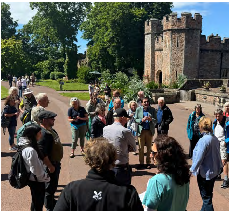
AGM at Dunster Castle

The charity continues to receive over 1,000 enquiries a month, with a third of these coming from members. The charity dealt with several issues and complaints over the year. Most complaints were related to web site issues in the summer, which were resolved.