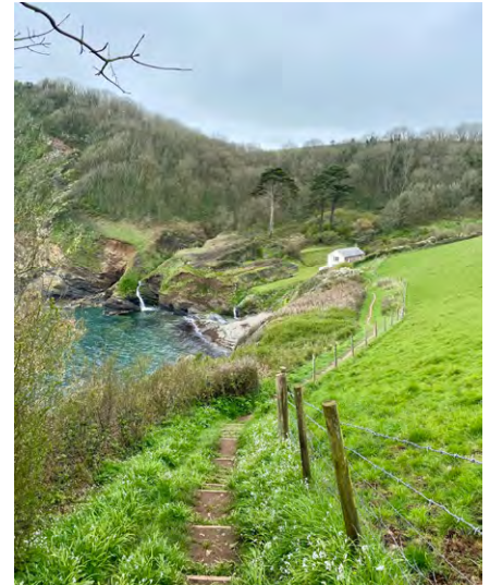
Trenarren, Blackhead, South Cornwall.