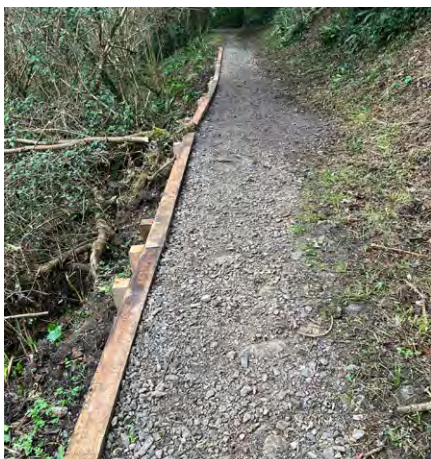
Trail Surface improvements, Dunscombe, Near Branscombe.