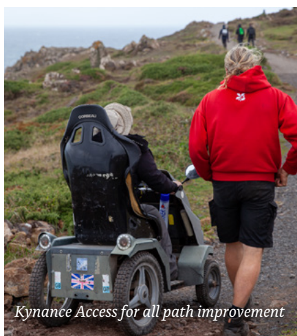
Kynance Access for all path improvement