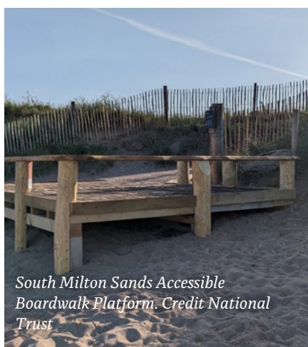
South Milton Sands Accessible Boardwalk Platform.