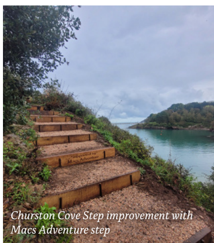
Churston Cove Step improvement with Macs Adventure step