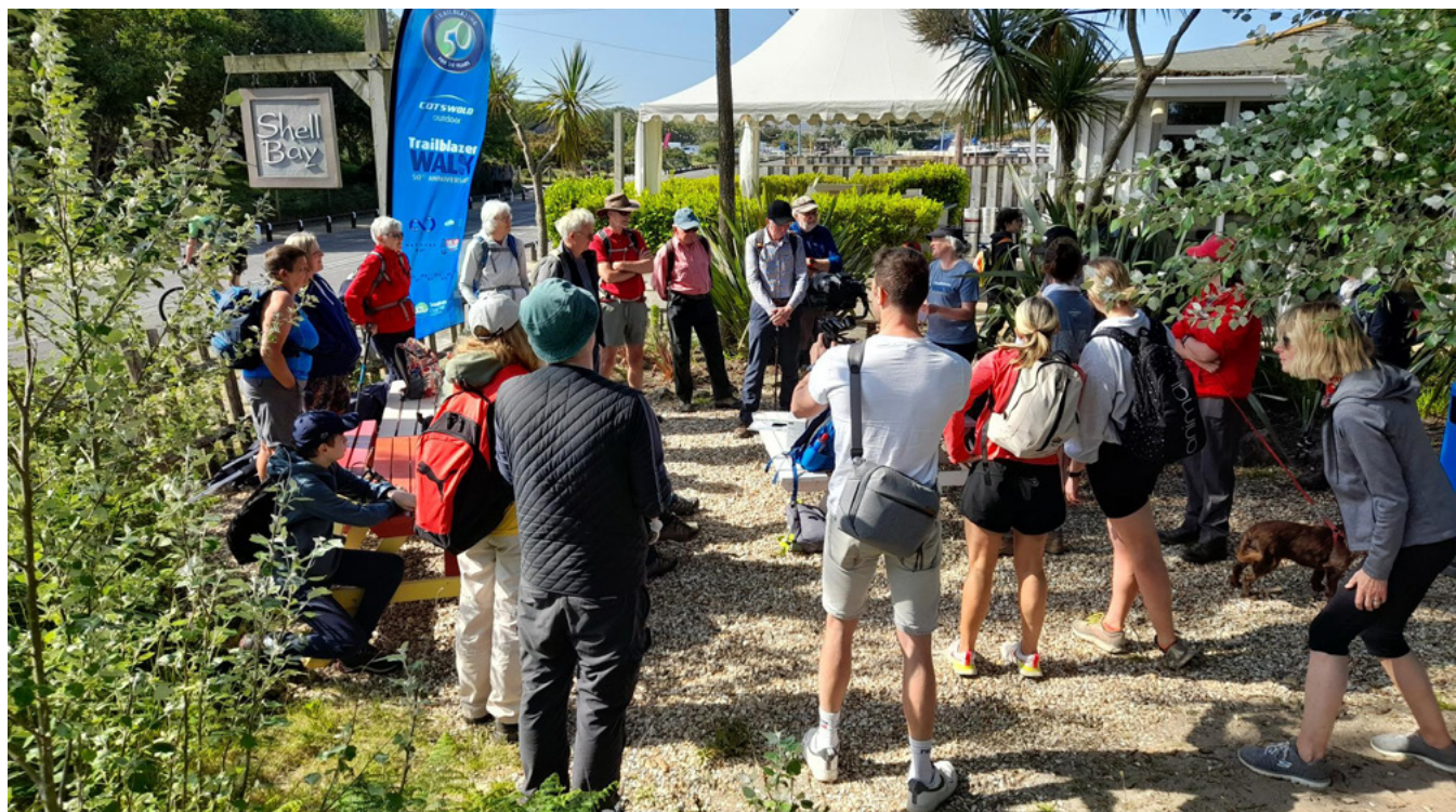
Trailblazer Walk starting at South Haven Point

None of our Trustees receive remuneration or other benefit from their work with the Charity. Trustees are required to complete an annual Declaration of Interests as well as to state any conflicts of interest before the start of each Board meeting. Trustees are also required to pass the HMRC "fit and proper" test as the Charity makes claims for tax relief.