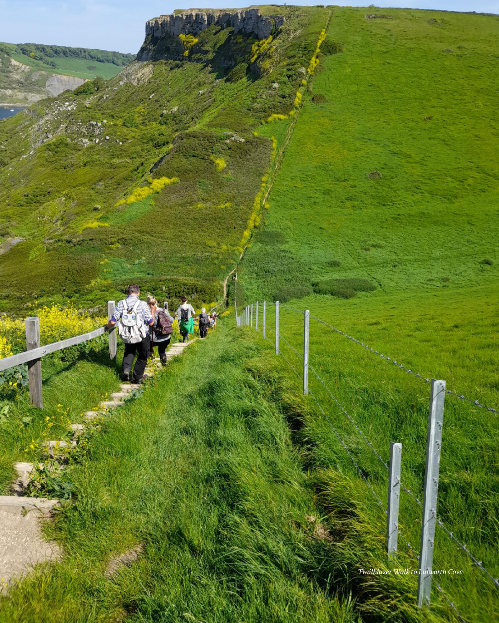
Trailblazer Walk to Lulworth Cove