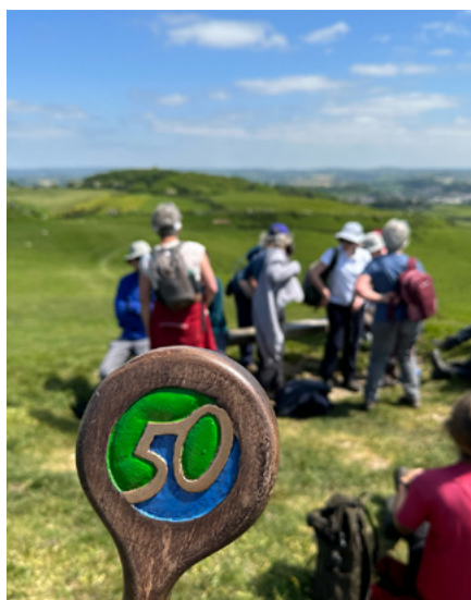
Trailblazer Walk, Dorset