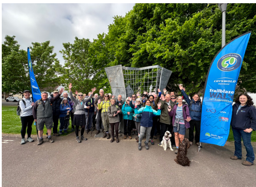
Start of the Trailblazer Walk in Minehead

This year marked the 50th anniversary of the charity. Over the year we undertook a series of activities and events to celebrate the South West Coast Path.