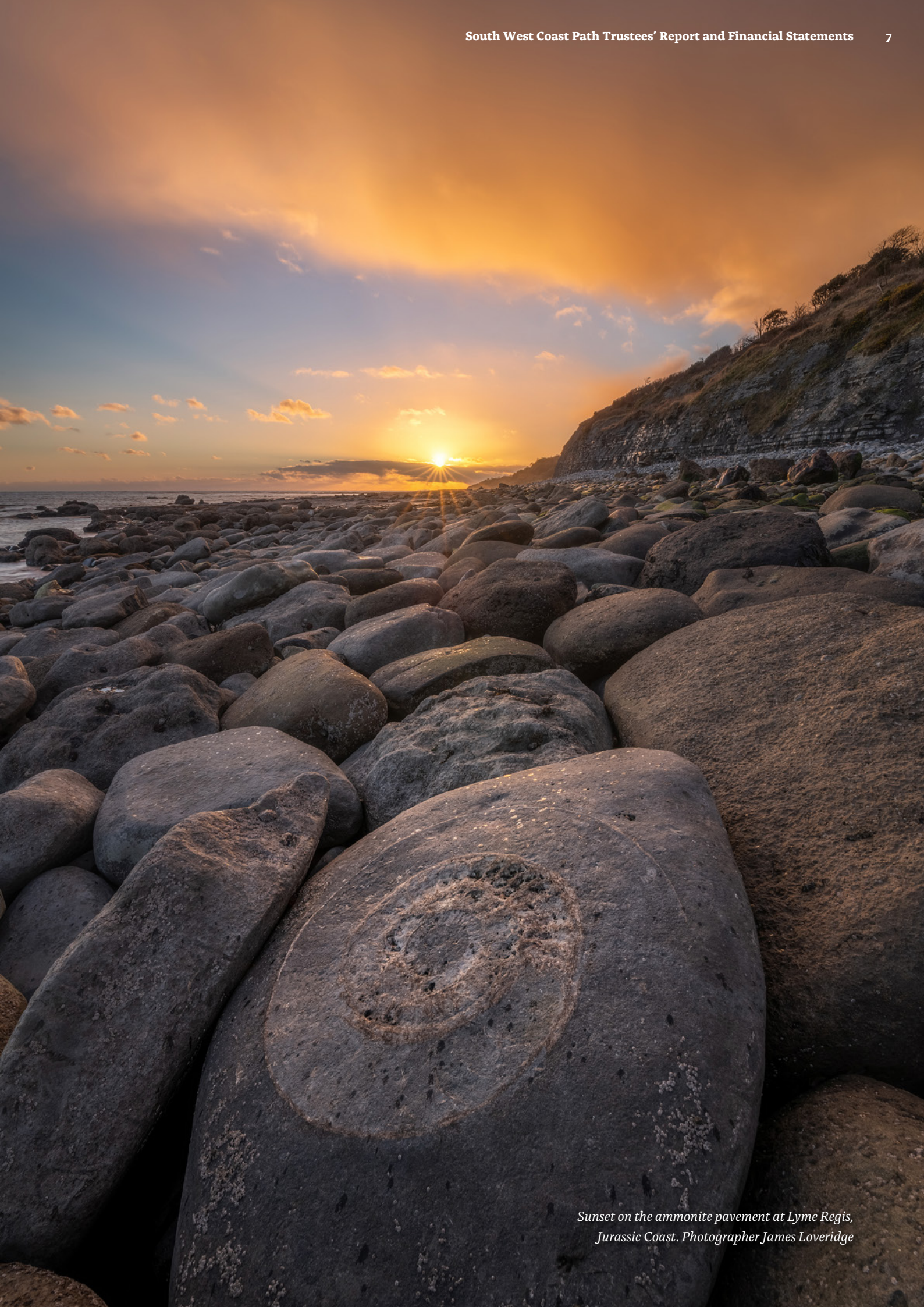
Sunset on the ammonite pavement at Lyme Regis, Jurassic Coast.