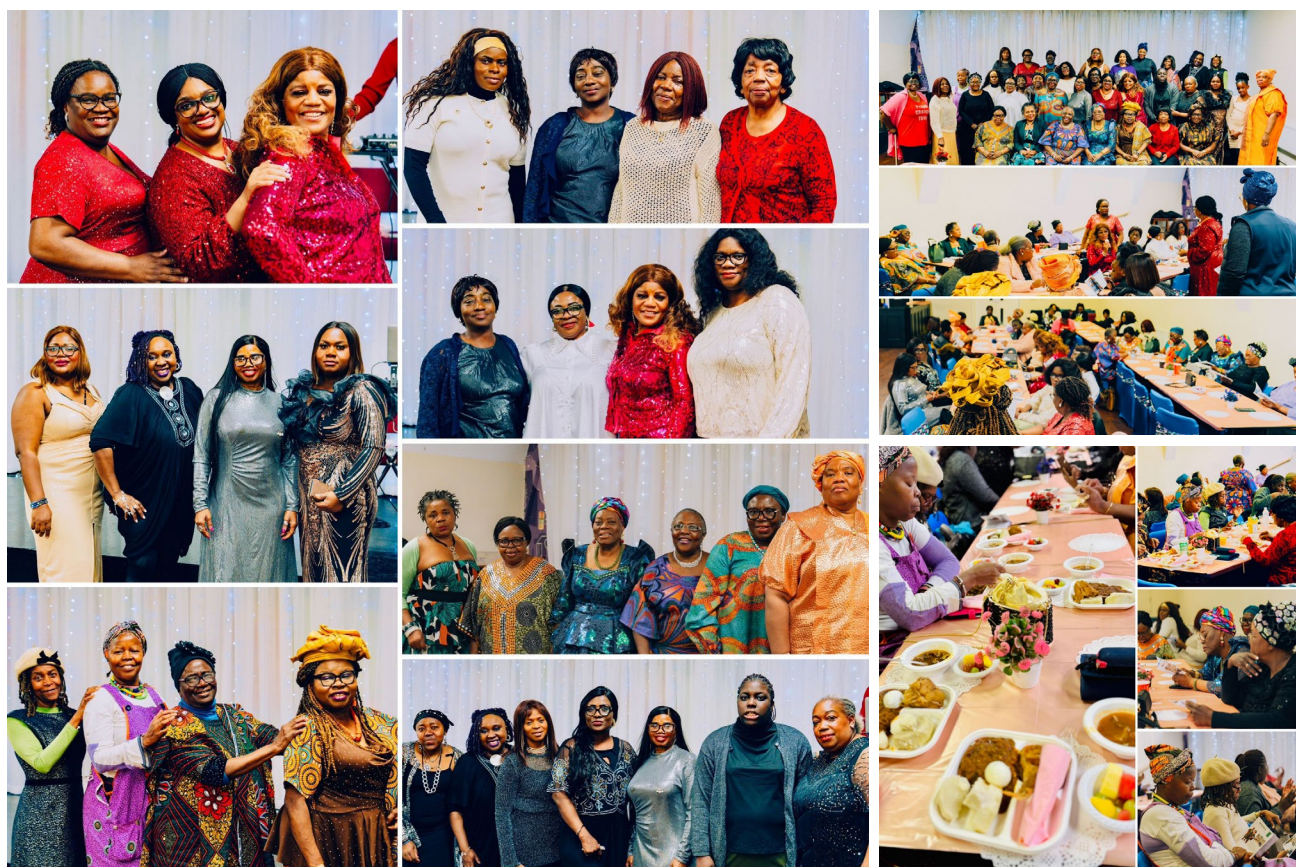
Black History Month Celebration

We are a volunteer-led organisation. Our trustees, volunteers, and service users have first-hand experience of the social and economic challenges we address. This lived experience fuels our passion and ensures our services remain relevant, compassionate, and effective. Flashy Wings provides women and girls' with a platform to be heard, to build confidence, and to tackle community issues together in a spirit of unity.