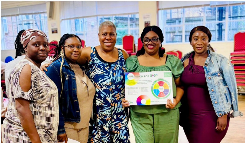
Southwark Neighbourhood Round Table Discussion