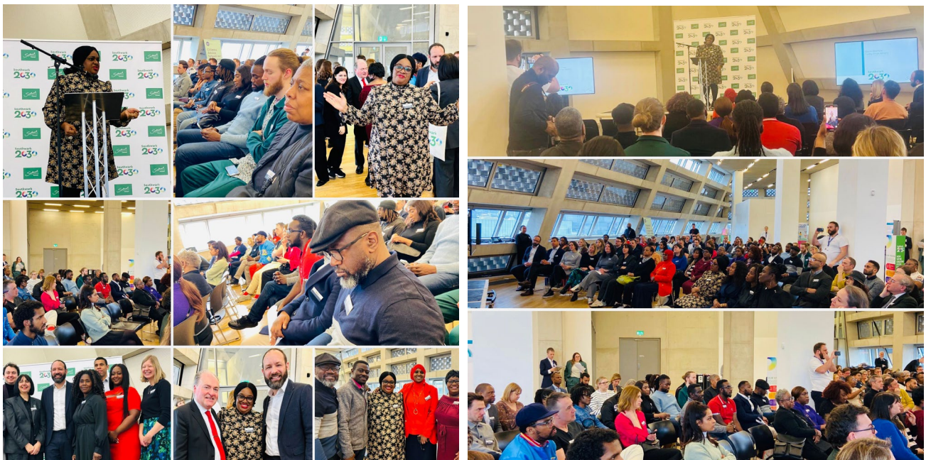
Southwark Vision 2030 Conference

Throughout the year, our staff participated in a comprehensive programme of training and professional development. As an organisation, we recognise that to sustain our vision, remain relevant, and respond effectively to the changing needs of our communities, continuous learning and capacity-building are essential. These trainings have supported both individual growth and collective organisational development.