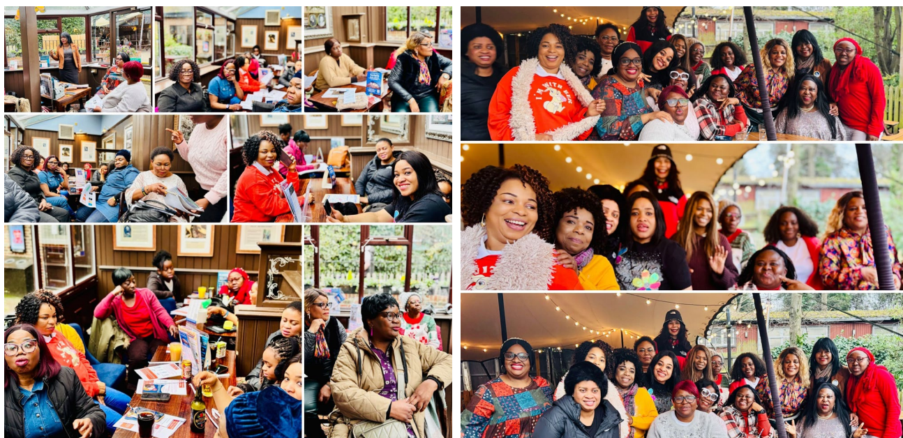
Energy Advice Breakfast meeting

Our community survey identified the energy crisis, domestic violence, and climate change as the top priority concerns. In response, the majority of our 2025 projects were designed specifically to support women and girls'.