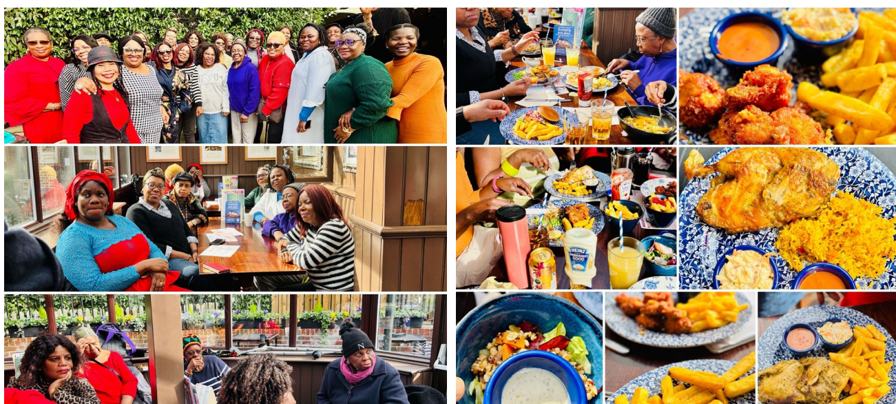
Domestic Violence Workshop

Founded by women living on Southwark estates, Flashy Wings was created in response to lived realities—economic hardship, domestic abuse, gang and knife crime, substance misuse, and mental health challenges. The founders envisioned a safe haven where women and girls' could connect, share experiences, and access inspiration, education, and empowerment. For a decade, Flashy Wings has delivered exactly that, becoming a well-known Black women and girls' charity in Southwark through deep community involvement.