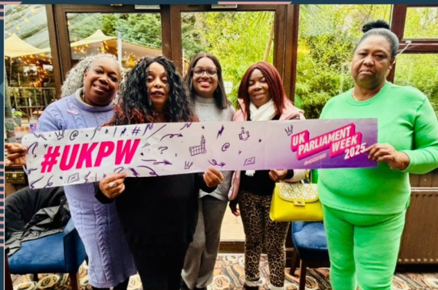
Parliament week celebration