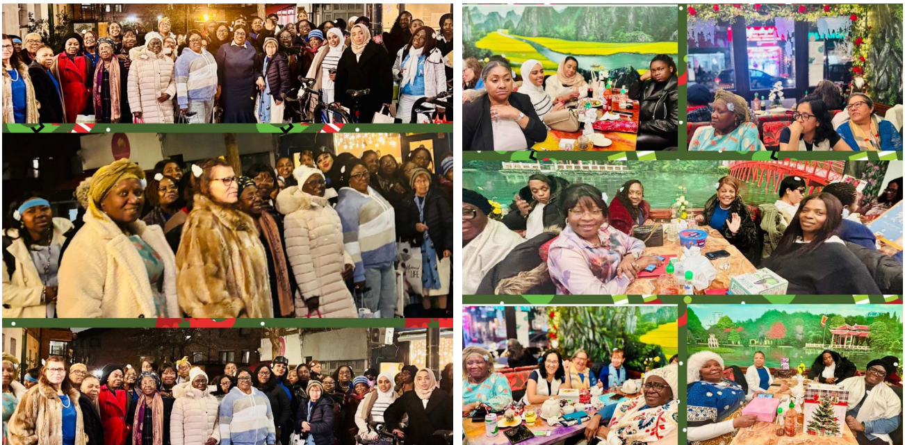
End of the year Christmas Party

At Flashy Wings, we believe every woman and girl deserves to flourish. With the right support, women and girls rebuild their lives, strengthen families, and uplift entire communities. Together, we are creating a future where no woman or girl in Southwark is left behind.