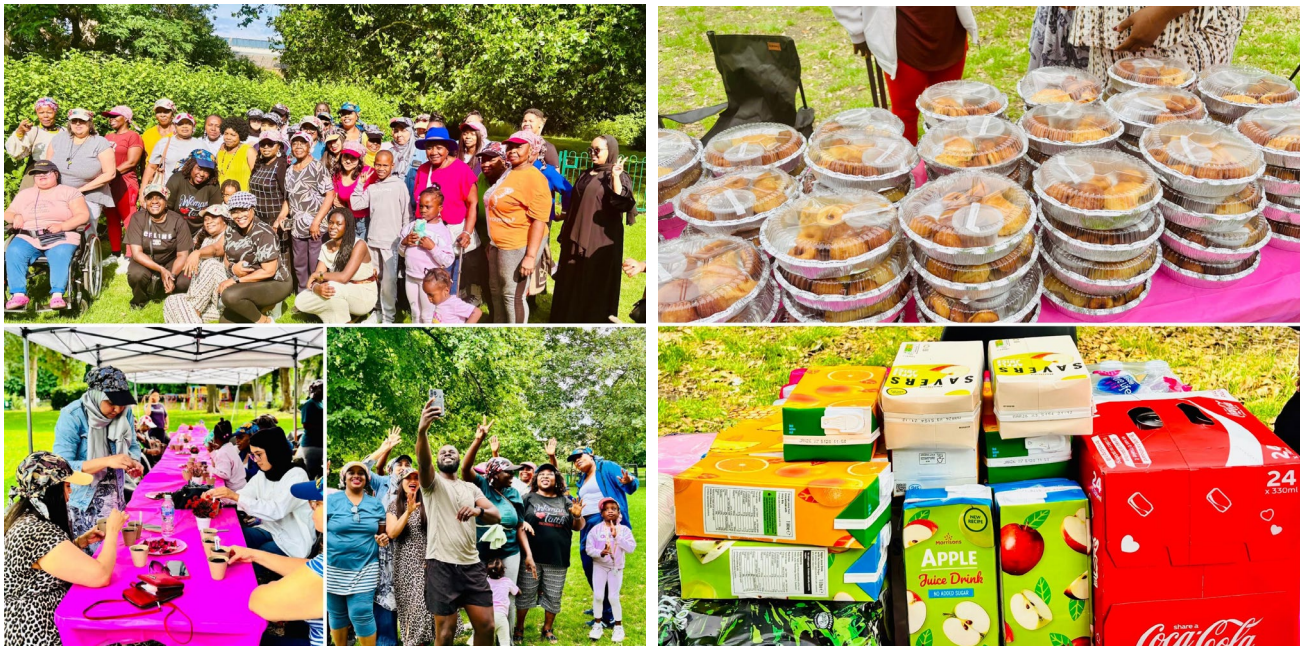
Summer Outdoor Activity

This positive balance reflects careful financial management throughout the year. Flashy Wings will continue to apply for grants and external funding to ensure the sustainability of its projects and the continuation of its activities.