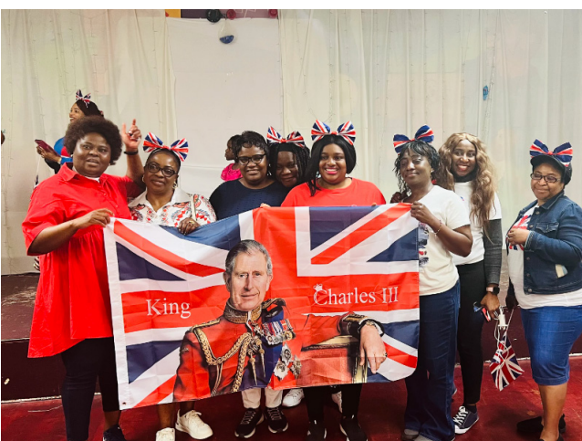
King Charles coronation party