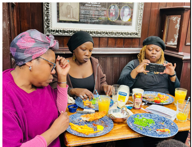
Flashy Wings Group Therapy