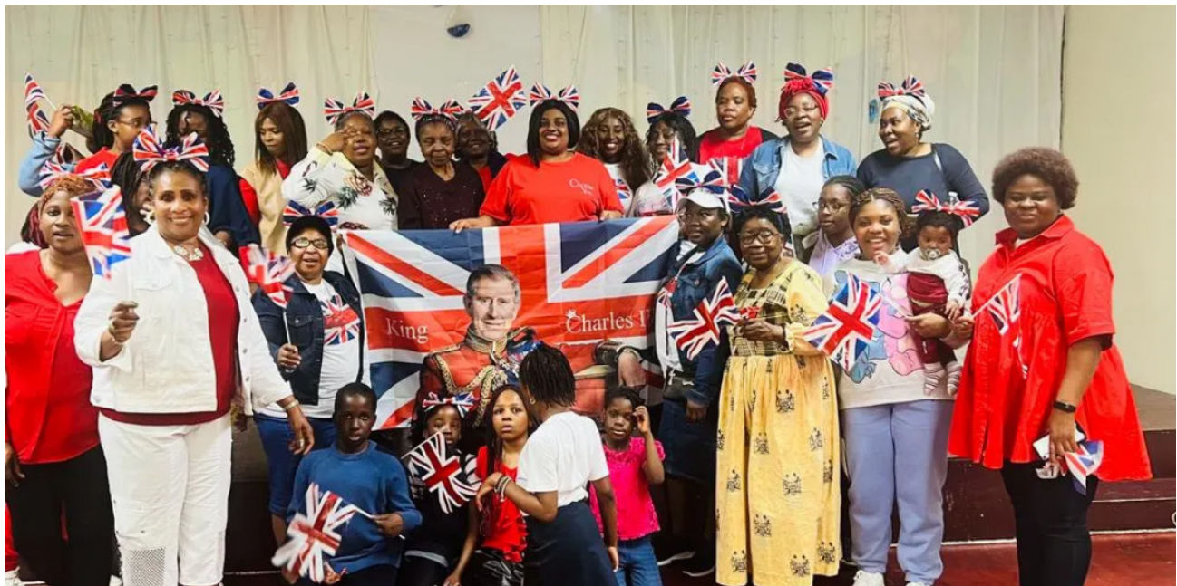
King Charles coronation party