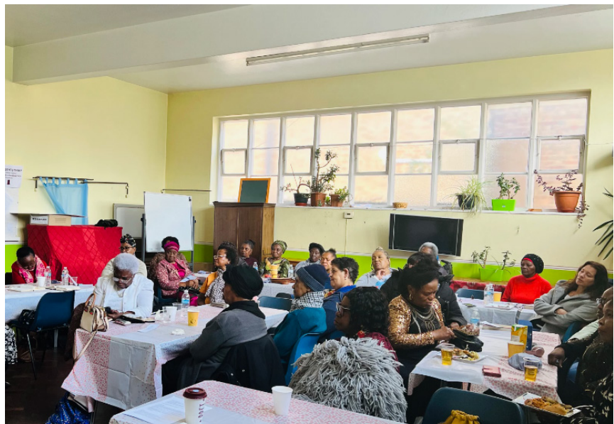
Project Golden age Snr Citizens lunch club