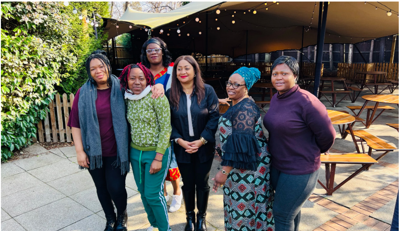
Flashy Wings group therapy class

Flashy wings organisation is not without challenges although we are good at surmounting any mountain of problems around us. One of our big challenges is the timing of accessing successful grants, we are a small grass-root charity, so our main source of grant is through funding. In most cases, it can take three or more months to access a successful grant, which leads to lots of delays, project pile over, and project spill over. For instance, this year we have not completed all our projects due to some funder payment delay, we are to carry some of the projects over to 2024. In some cases, some funders do delay but want the project to end within the duration given, this can be very stressful for the team, although in every situation we always try our best.