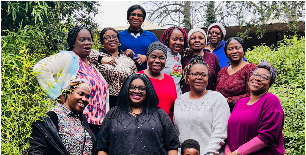
Flashy Wings Group Therapy

We also set up a discussion group for Mums to address the issues around child vaccination decline to improve immunisation rates in Southwark amongst families with children in our BAME community. In order to break the myth and conspiracy theories around child vaccination, we proposed a three-day Mum's discussion group where this topic was addressed; We consulted with mums and came up with ideas on what the NHS can do to keep on promoting vaccination. Participants found the sessions interactive and educative.