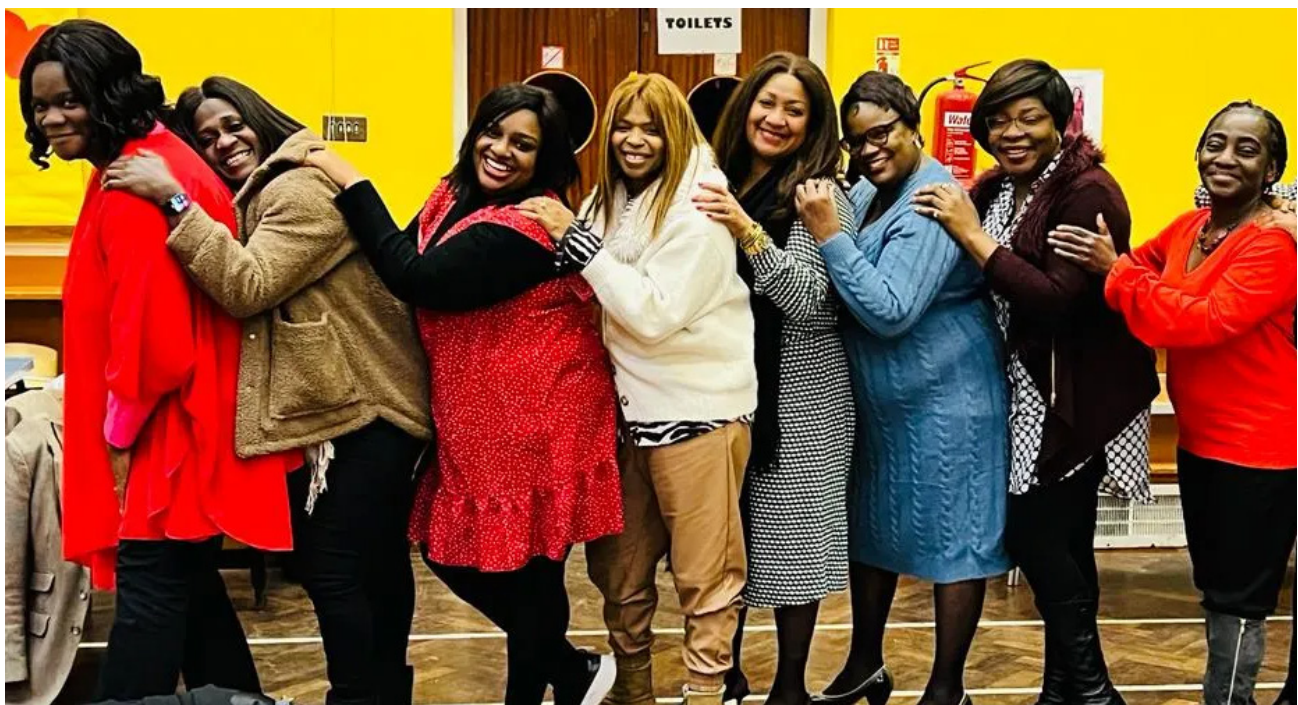
Flashy Wings Breakfast Club