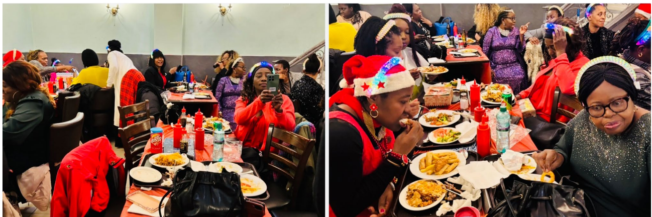
End of year Christmas party

The training has equipped our team, with the knowledge, skills, and confidence to carry out their duties efficiently in the organisation.