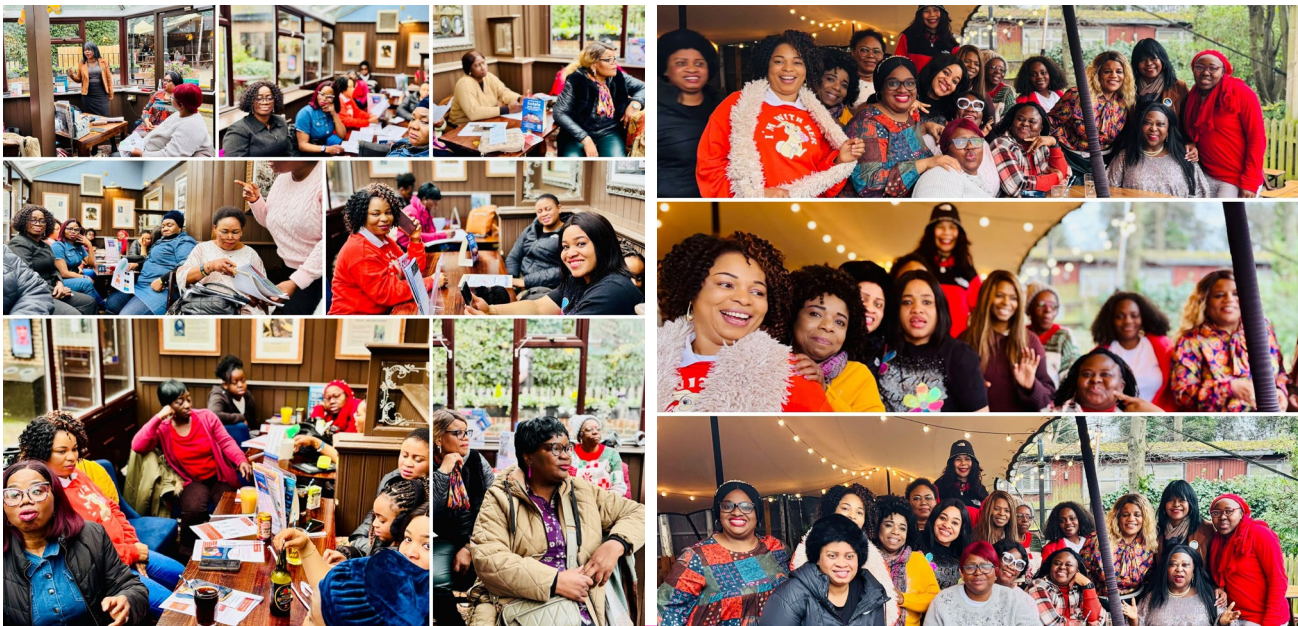
Energy Advice Breakfast meeting

Our community survey identified the energy crisis, domestic violence, and climate change as the top priority concerns. In response, the majority of our 2025 projects were designed specifically to support women and girls'.