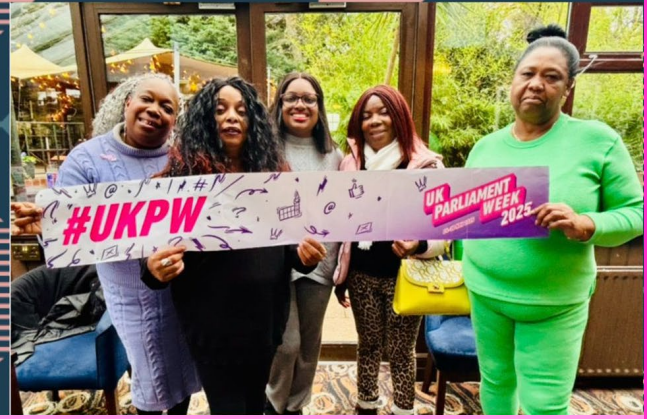
Parliament week celebration