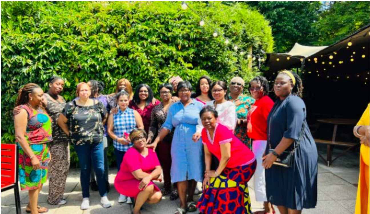
Flashy Wings group therapy class

Flashy wings organisation is not without challenges although we are good at surmounting any mountain of problems around us. One of our big challenges is the timing of accessing successful grants, we are a small grass-root charity, so our main source of grant is through funding. In most cases, it can take three or more months to access a successful grant, which leads to lots of delays, project pile over, and project spill over. For instance, this year we have not completed all our projects due to some funder payment delay, we are to carry some of the projects over to 2023. In some cases, some funders do delay but want the project to end within the duration given, this can be very stressful for the team, although in every situation we always try our best.