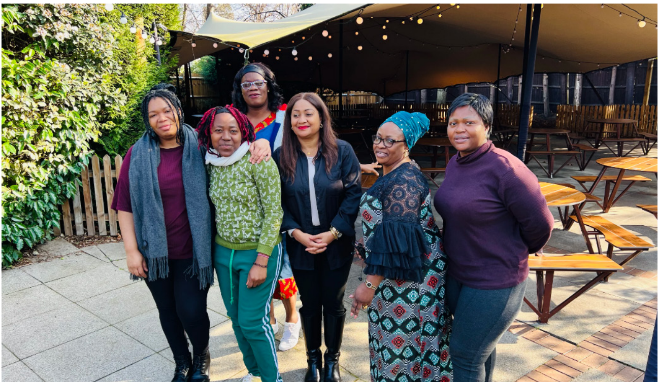
Flashy Wings group therapy class

Flashy wings organisation is not without challenges although we are good at surmounting any mountain of problems around us. One of our big challenges is the timing of accessing successful grants, we are a small grass-root charity, so our main source of grant is through funding. In most cases, it can take three or more months to access a successful grant, which leads to lots of delays, project pile over, and project spill over. For instance, this year we have not completed all our projects due to some funder payment delay, we are to carry some of the projects over to 2024. In some cases, some funders do delay but want the project to end within the duration given, this can be very stressful for the team, although in every situation we always try our best.