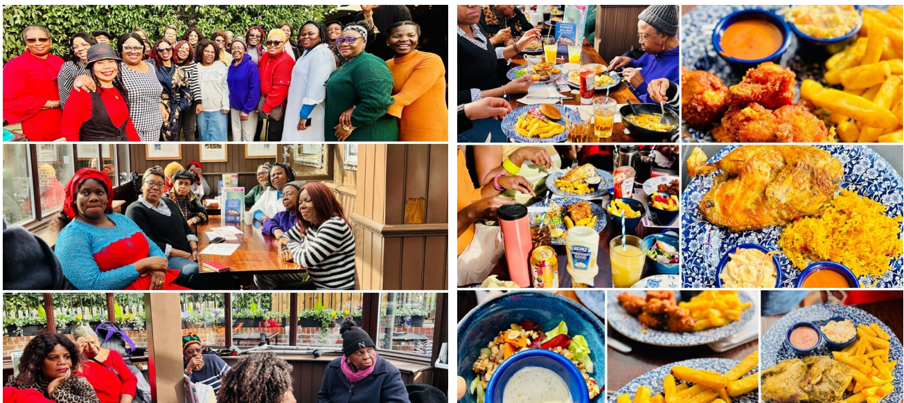
Domestic Violence Workshop

Founded by women living on Southwark estates, Flashy Wings was created in response to lived realities—economic hardship, domestic abuse, gang and knife crime, substance misuse, and mental health challenges. The founders envisioned a safe haven where women and girls' could connect, share experiences, and access inspiration, education, and empowerment. For a decade, Flashy Wings has delivered exactly that, becoming a well-known Black women and girls' charity in Southwark through deep community involvement.