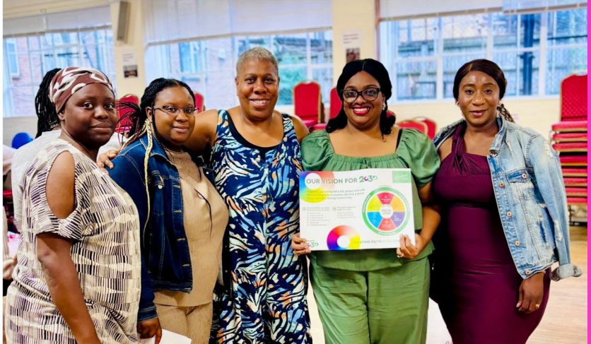
Southwark Neighbourhood Round Table Discussion