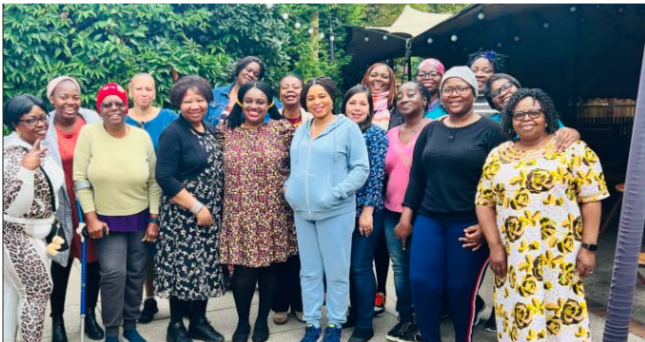
Flashy Wings group therapy class

Flashy wings have drawn a repertoire of ranks and reaching! Which includes winning the Mayor of Southwark civic award, Southwark star award, Wise women award, and London faith and belief community awards.