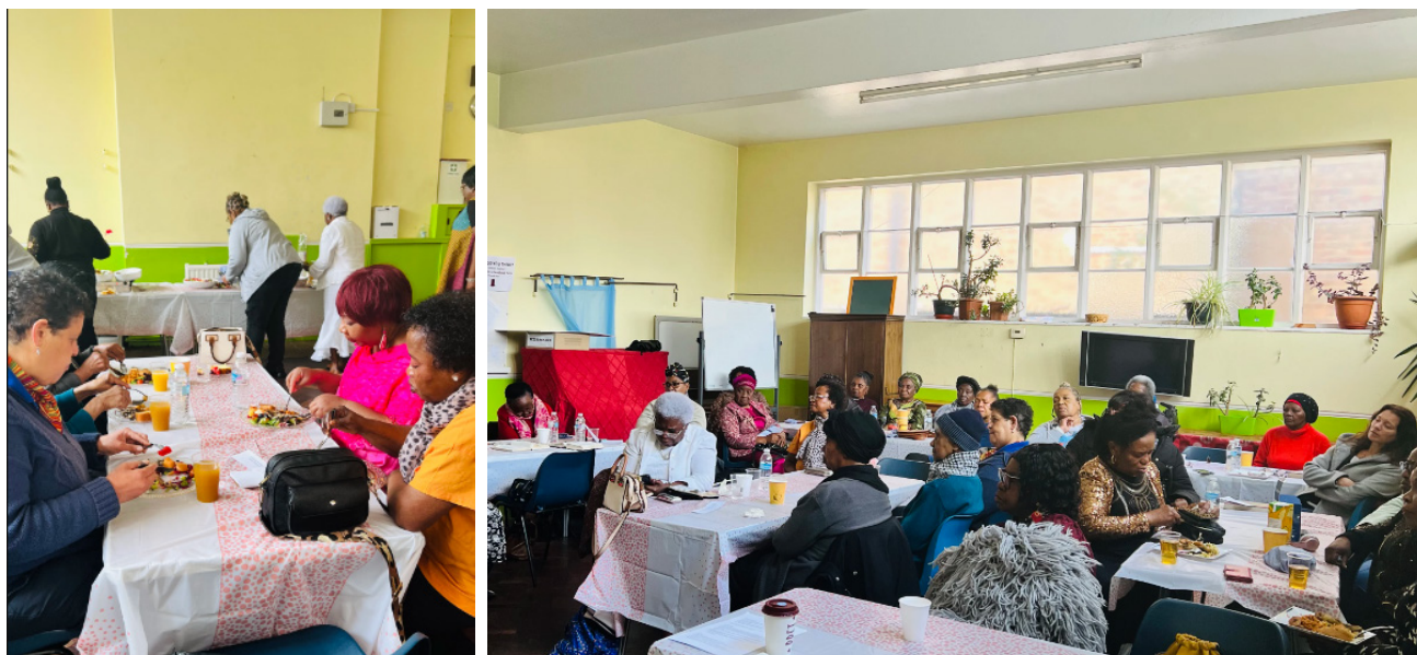
Project Golden age Snr Citizens lunch club