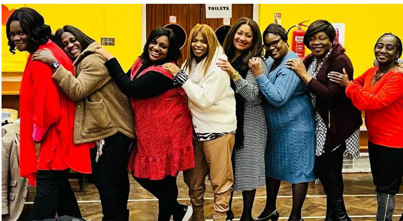
Flashy Wings Breakfast Club