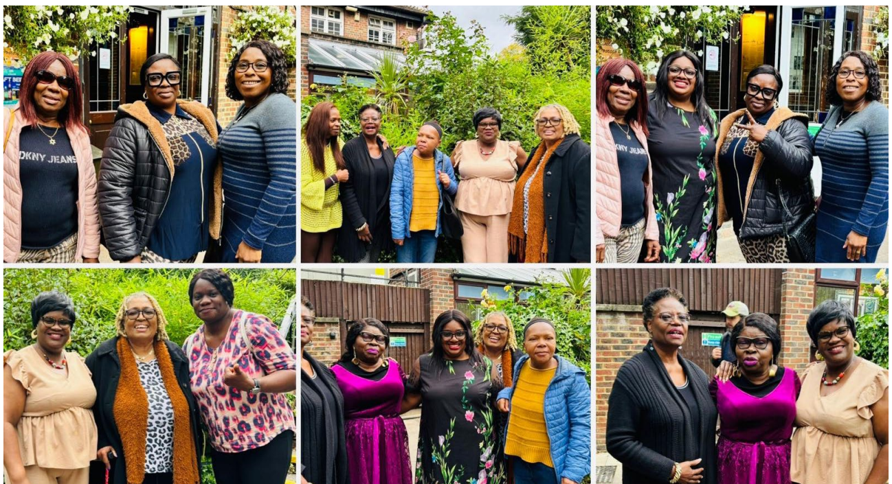
Energy Advice Workshop

In addition, we are among the charities in Southwark referring people to Southwark Community Referral Pathway scheme, for Southwark Cost of Living Fund, to help towards energy bills. We were able to support over 400 household to claim £100.