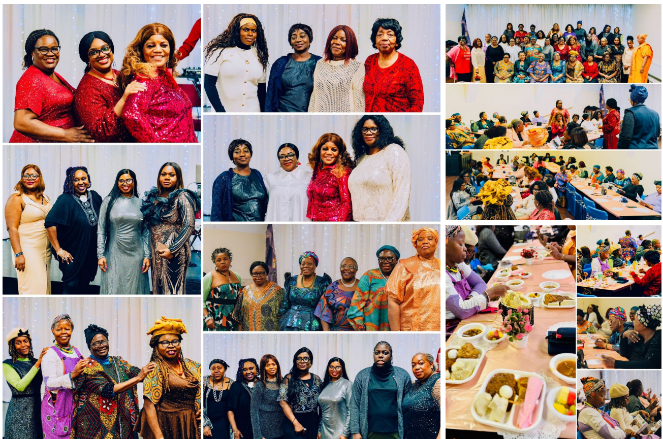
Black History Month Celebration

We are a volunteer-led organisation. Our trustees, volunteers, and service users have first-hand experience of the social and economic challenges we address. This lived experience fuels our passion and ensures our services remain relevant, compassionate, and effective. Flashy Wings provides women and girls' with a platform to be heard, to build confidence, and to tackle community issues together in a spirit of unity.