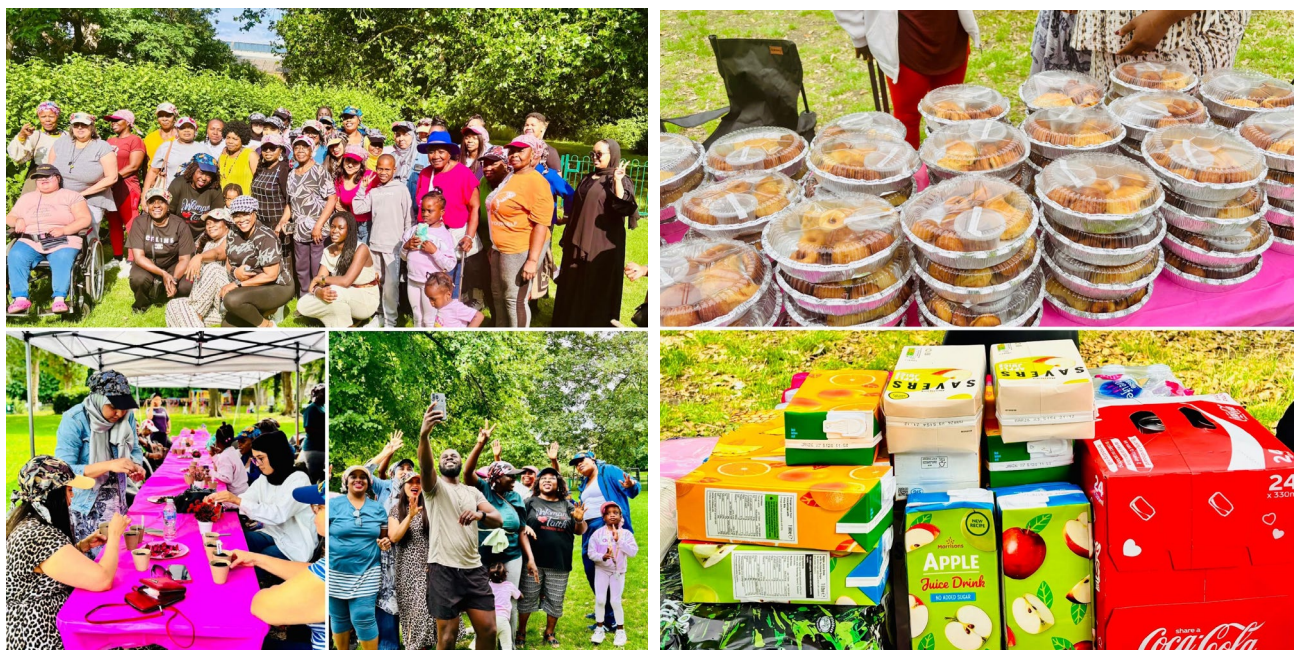
Summer Outdoor Activity

This positive balance reflects careful financial management throughout the year. Flashy Wings will continue to apply for grants and external funding to ensure the sustainability of its projects and the continuation of its activities.