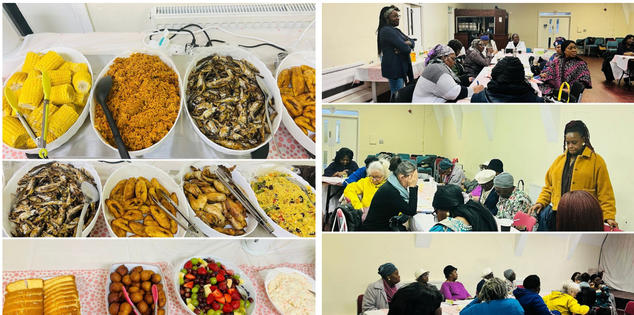
Project Golden Age, Senior Citizens Lunch Club