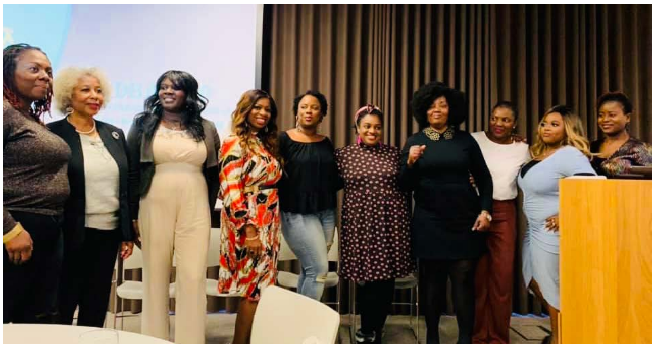
Flashy Wings Safe guiding training