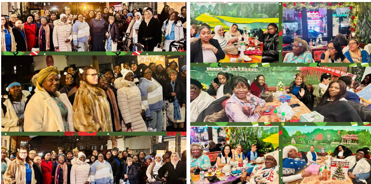
End of the year Christmas Party

At Flashy Wings, we believe every woman and girl deserves to flourish. With the right support, women and girls rebuild their lives, strengthen families, and uplift entire communities. Together, we are creating a future where no woman or girl in Southwark is left behind.