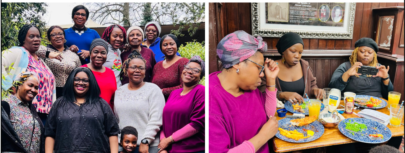
Flashy Wings Group Therapy