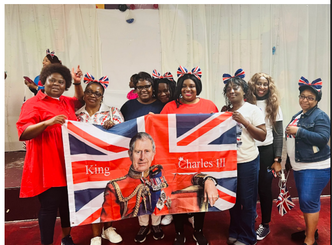
King Charles coronation party