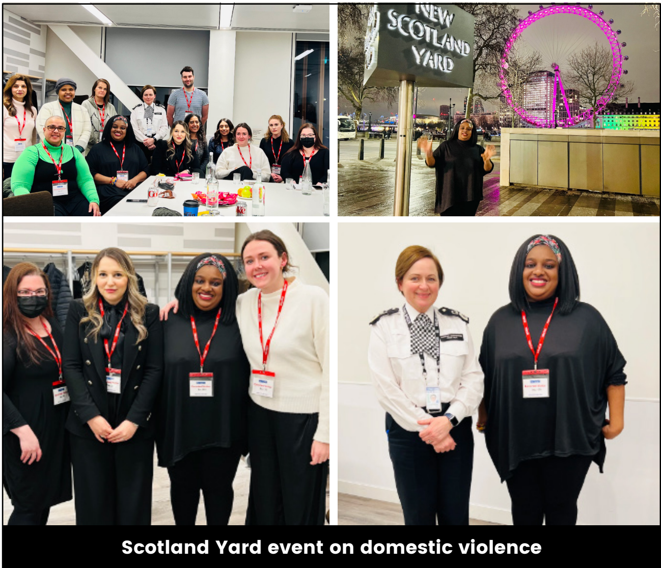
Scotland Yard event on domestic violence

We continued with our project Love Box Food Distribution to families in need. Over 250 families benefited regularly, and we hope to get more funds to keep the project going.