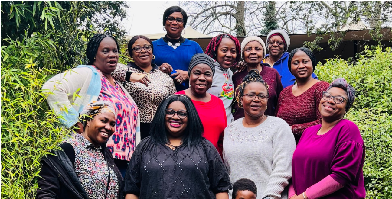
Flashy Wings Group Therapy

We also set up a discussion group for Mums to address the issues around child vaccination decline to improve immunisation rates in Southwark amongst families with children in our BAME community. In order to break the myth and conspiracy theories around child vaccination, we proposed a three-day Mum's discussion group where this topic was addressed; We consulted with mums and came up with ideas on what the NHS can do to keep on promoting vaccination. Participants found the sessions interactive and educative.