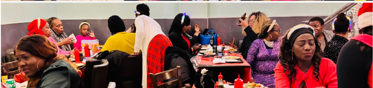
End of year Christmas party