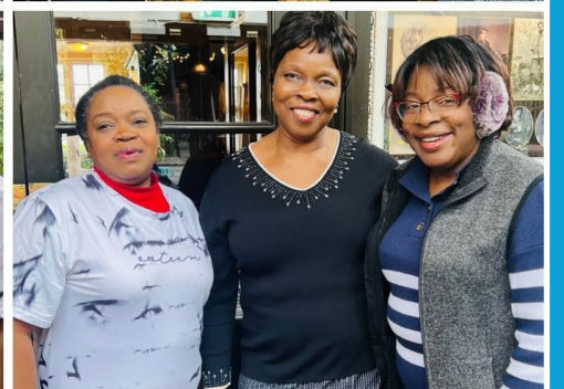
Women's Breakfast Club