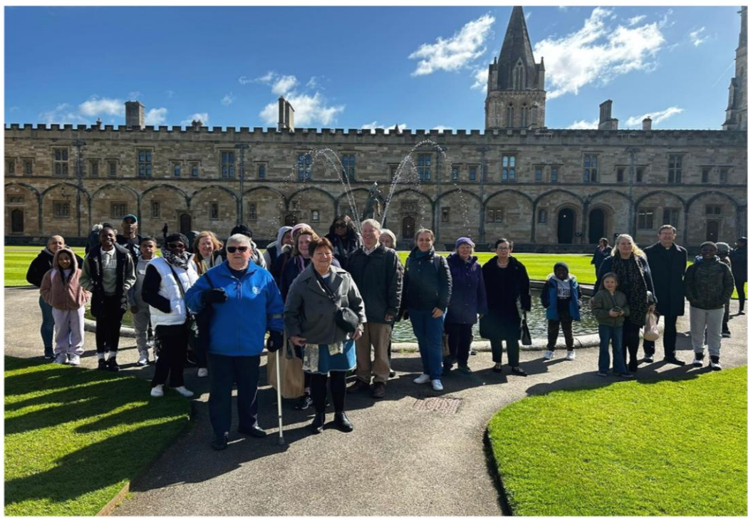
Visit to All Souls' College and Christchurch Cathedral Oxford (shown here) in celebration of St John's 180 th Anniversary Year.