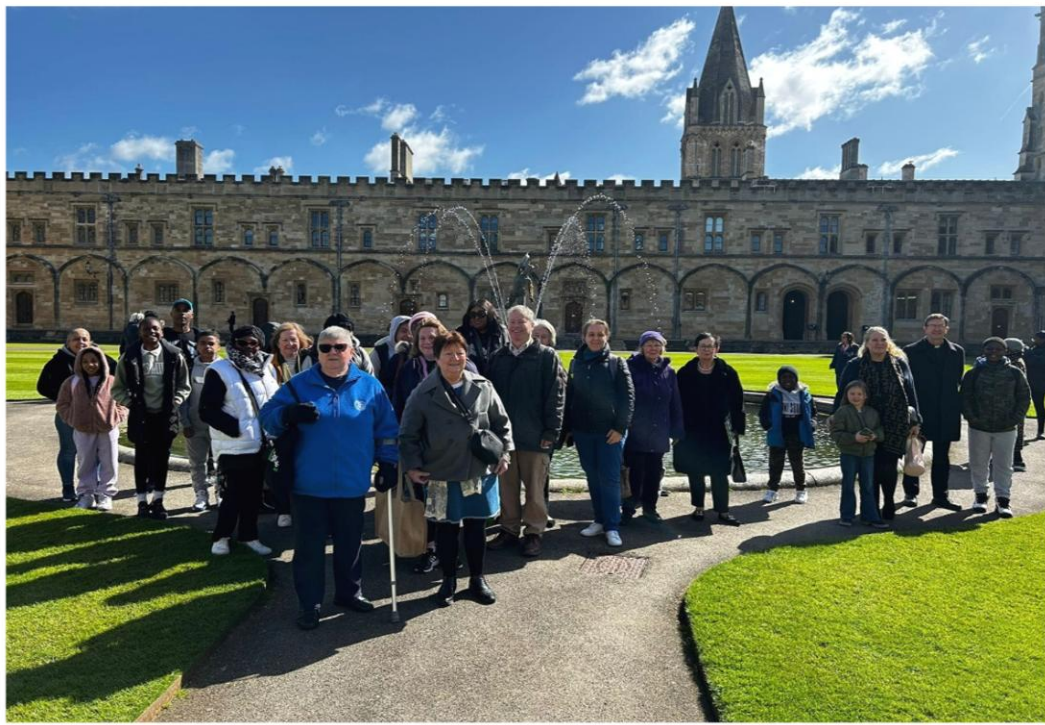
Visit to All Souls' College and Christchurch Cathedral Oxford (shown here) in celebration of St John's 180 th Anniversary Year.