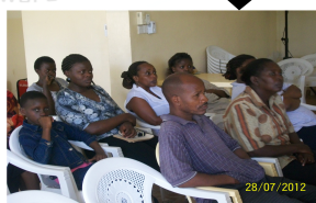
EEP Training Session