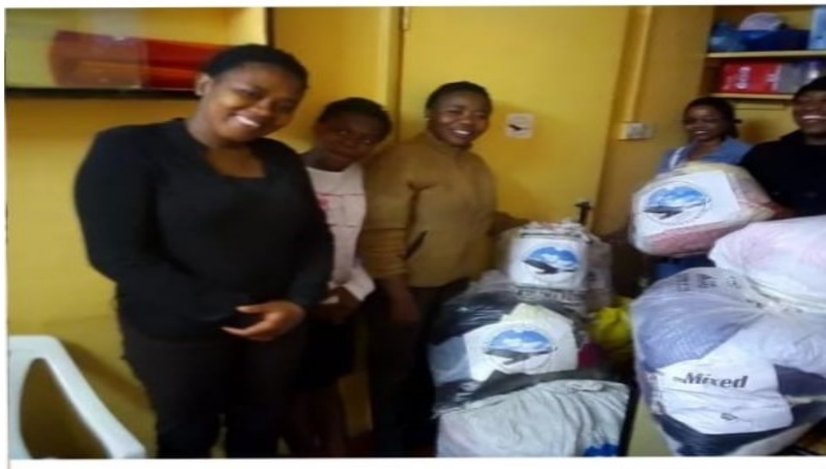
Solace donations: Food and clothes parcels for the needy