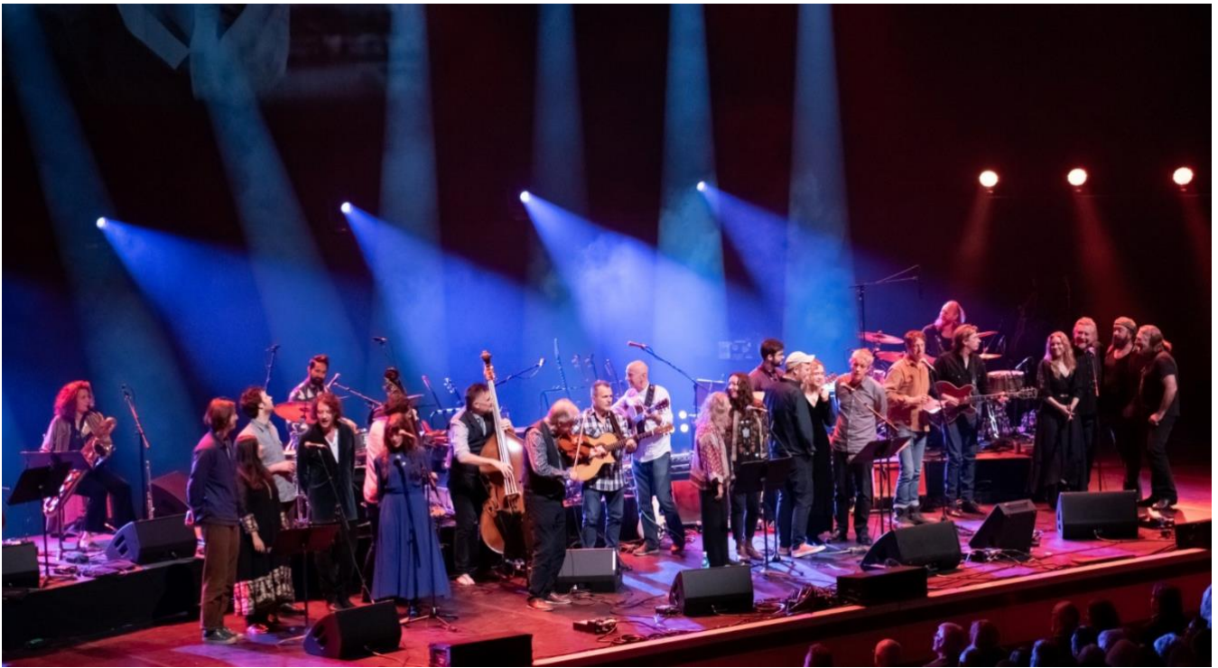
The cast of Bert80 Strolling down the Highway