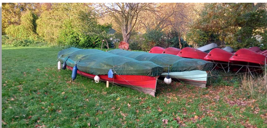
Skerries Jim Clark and John Bryant, safely tucked up for winter

The Osterley Sea Scouts also kindly gave two of our skerries 'house-room' over winter this year. Keeping skerries on the tidal Thames is quite punishing to the boats, so being able to over-winter some of our boats is immensely important for their maintenance and protection.