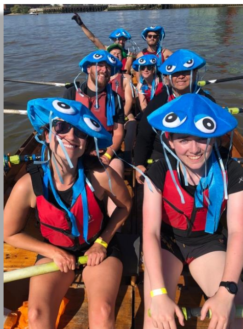
Oarsome Challenge, 2022

This year, two of our skerries were also hired for use in the annual marathon on the Thames, The Great River Race. The parents and teachers of Deer Park School were one of the teams who worked with us to take part in the GRR, raising funds for their school, and we look forward to working with their Year 6 children next year.