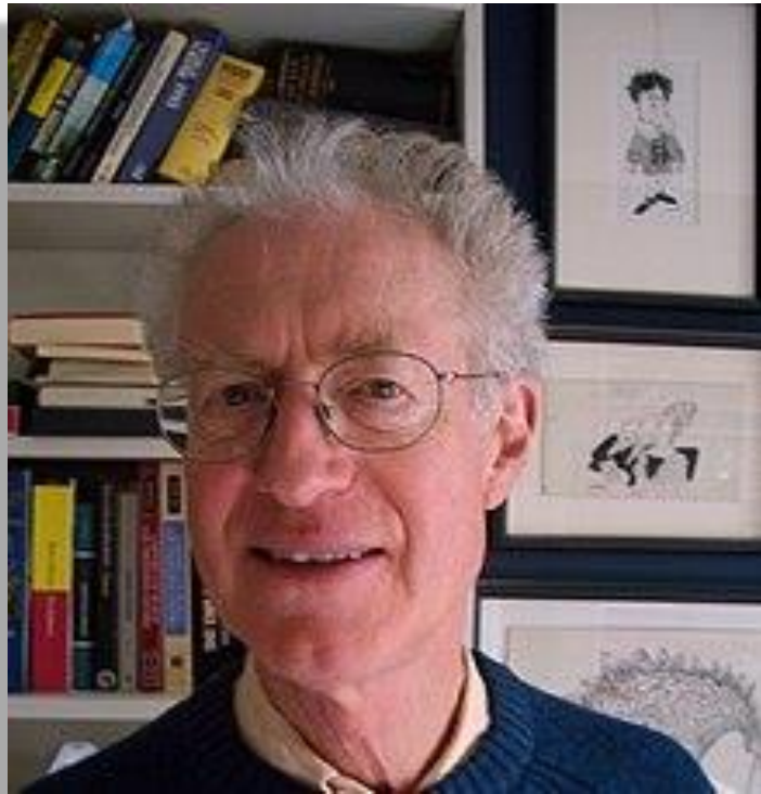
Arthur Bamber Gascoigne CBE FRSL (24 January 1935 – 8 February 2022)