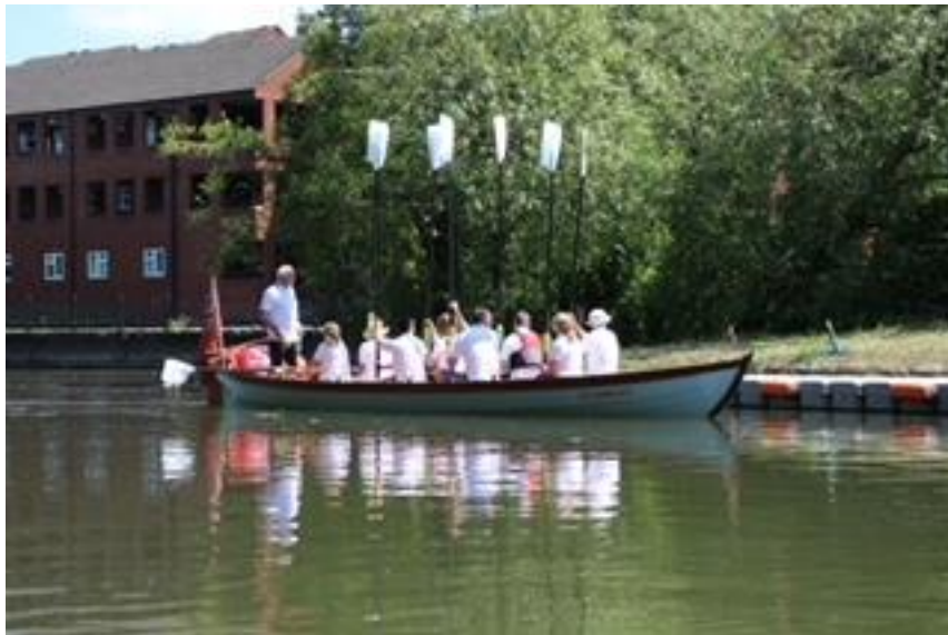
Our new Skerry FLOREAT on its maiden voyage

The year ending 31 st December 2021 ended up much as was predicted, due primarily to the ongoing effect of the Covid epidemic.