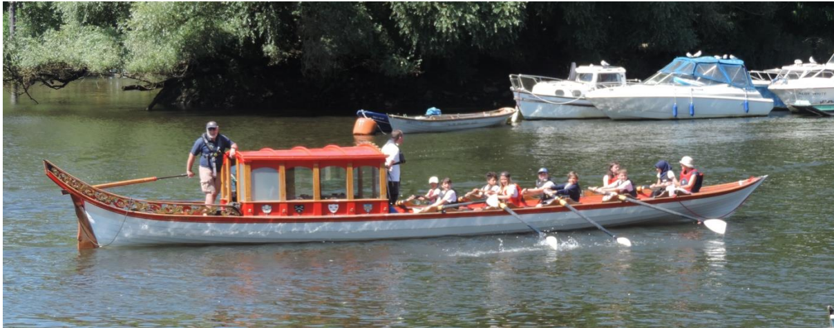
Darell Road School rowing Jubilant as an appreciation of good performances during the difficult Covid year

We managed to take out three boats with Darell Road primary school, including the Queen's Shallop Jubilant, loaned to us by our friends at 14 th Richmond Scout Boating Centre and another two boats with our friends from St Phillip's SEN school.