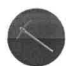
LUBUMBASHI Democratic Republic of Congo