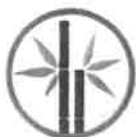
NORTH EAST India