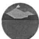
GOMA Democratic Republic of Congo