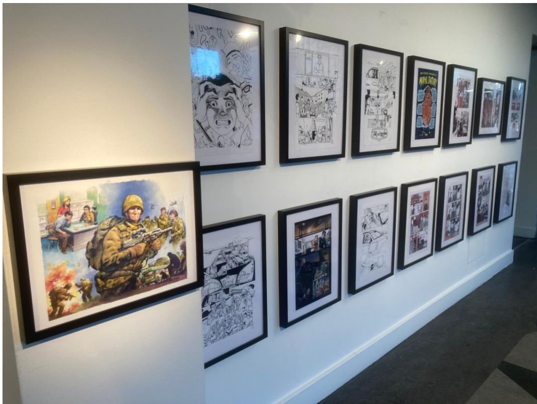
Coming Home Exhibition, Creative Brain Week, Trinity College, Dublin

We want to take this opportunity to thank all Re-Live practitioners for their continued excellence in the field of Arts in Health and to our grant funders and individual donors, for whom none of this work would be possible - The Arts Council of Wales, The Armed Forces Covenant Fund Trust, The National Lottery and The Atlantic Fellows Institute.