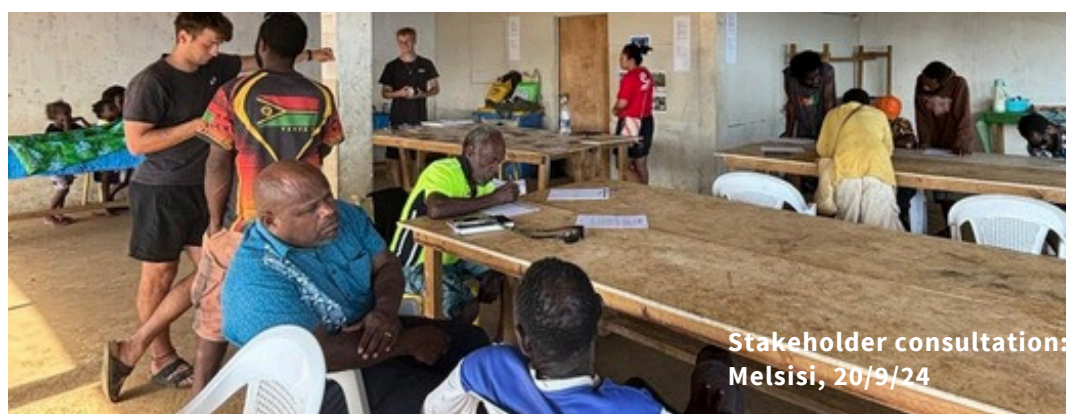
Stakeholder consultation: Melsisi, 20/9/24