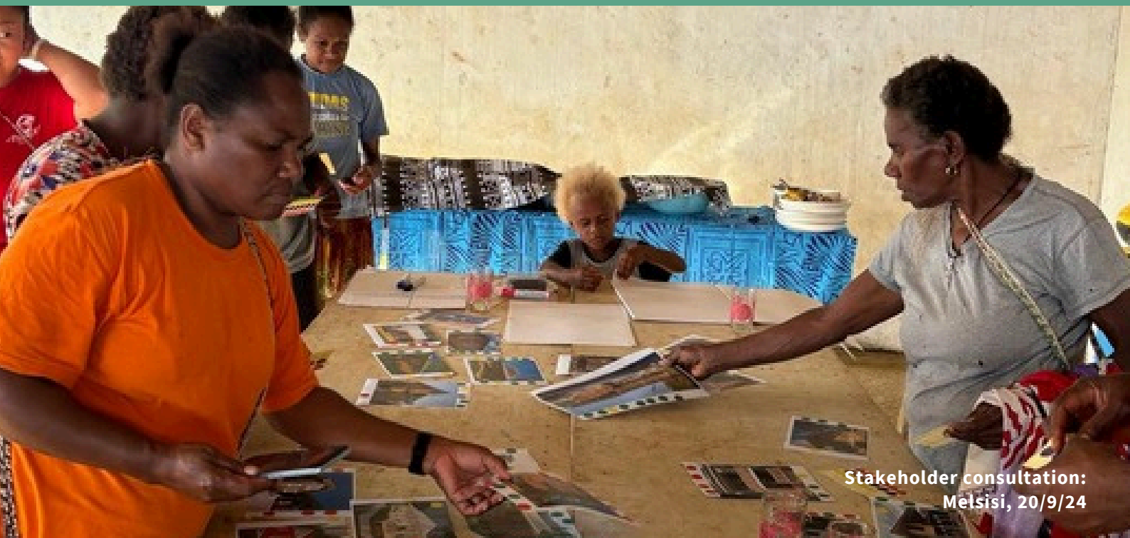
Stakeholder consultation: Melsisi, 20/9/24