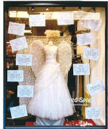
Shared Space shop window, announcing Boost Fund Grants

By re-purposing a charity shop model, we provide life-changing volunteering and training opportunities more than 140 volunteers a year. Their volunteering work raises funds to support local charities and initiatives through the Shared Space 'Boost Fund Grants Programme' with the awarding of grants directed by panels of volunteers.