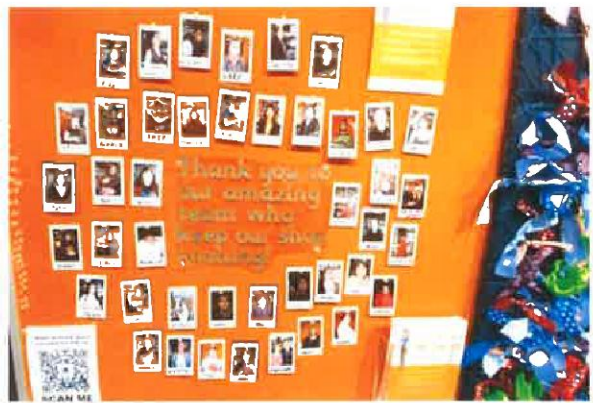
Some of the volunteers at one of our sites