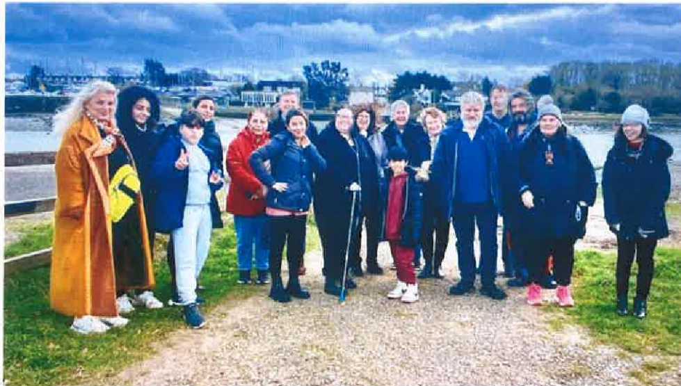
Shared Space volunteers on a joint day away with Church from Scratch

life-changing volunteering opportunities