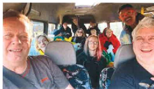
Residential volunteer weekend in Kent