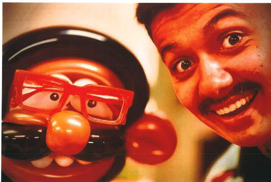
Balloon modelling on a weekend away