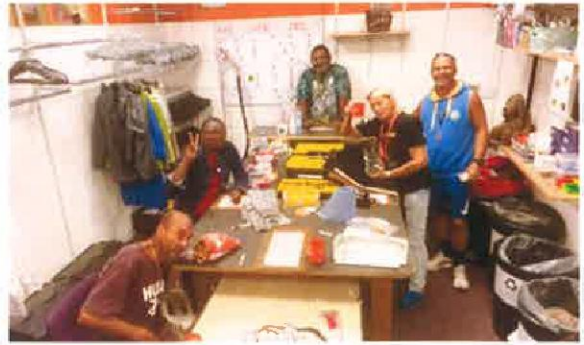
Some of the team sorting donations in one of the shops