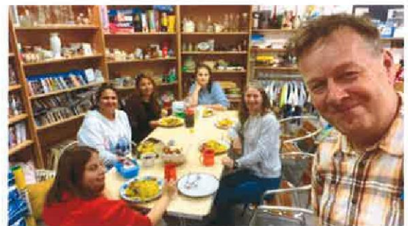
Weekly meal in one of the shops

Following our charity registration in 2015, we have enjoyed a strong partnership with Church from Scratch, the local Baptist church that started Shared Space as a project and then constituted it as the separate charity it is today. We continue to enjoy a close working relationship with the church for mutual benefit.