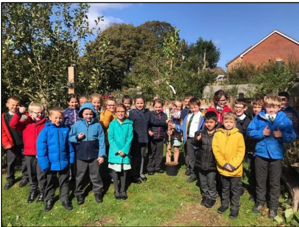
Widey Court Primary School pupils plant their Pilgrim 400 tree

With no further applications having been received by the new deadline, it was decided to make the trees available to schools and community groups free of charge, provided they were able to collect from Endsleigh Gardens Nursery at Milton Abbot. This resulted in a flood of applications and all forty trees were quickly allocated.