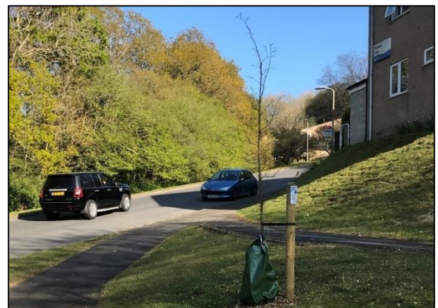
Transplanted tree in Wyoming Close

When a site was being cleared for development in February, the contractors needed to dig up four young trees but had nowhere for them to go. They contacted Plymouth Tree Partnership and, through our networks, we found them good homes. A silver birch went into Hartley Park and 3 fastigate beeches went to Wyoming Close.