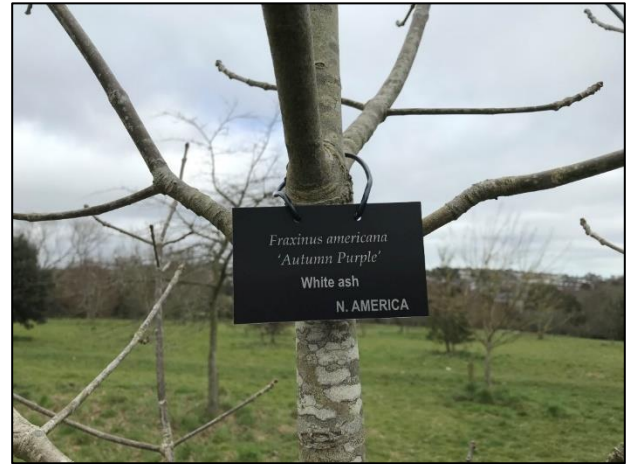
New tree label bought with the Co-op Community Fund grant

Tree Partnership their chosen cause. The money is being used to introduce a new tree labelling system, replace the damaged interpretation panel, install a new bench and make hedgebank repairs. Surplus funds are being used to buy more tools and to support future plantings.