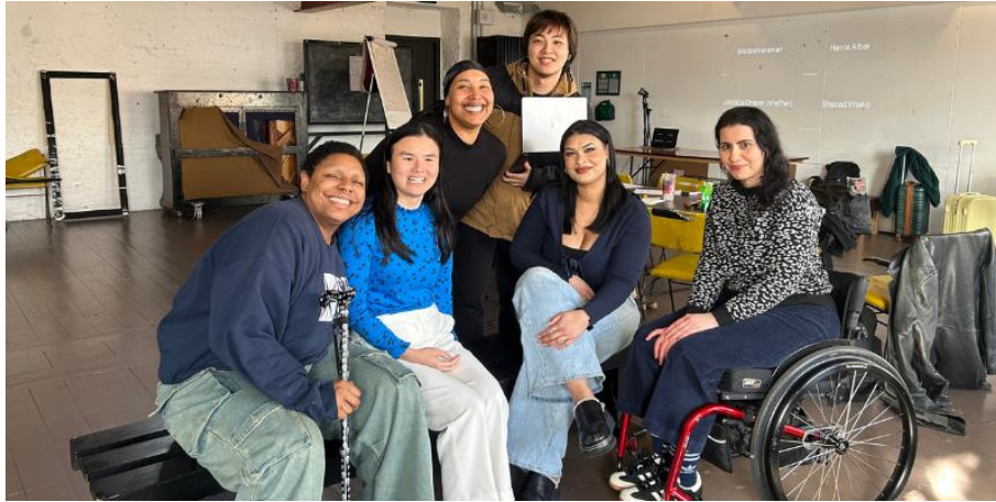
VX Labs Decolonising Disability, March 2025

“With the learning that we had, it spurred me and the other artists to access, participate and be selected to be part of the most amazing opportunities and I honestly believe that this wouldn’t have happened, if it wasn’t the empowerment that we received during that residency.”