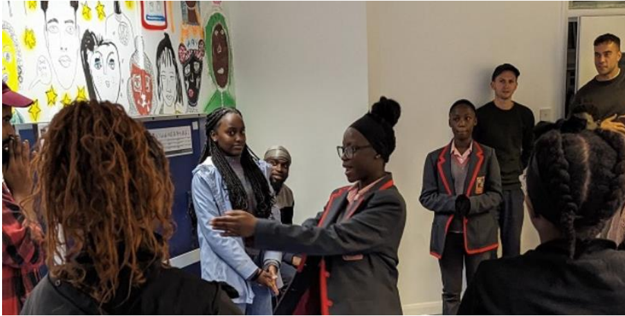
Quiet Rebels: Young People Workshops with Hackney Quest.

The end of 2024/25 saw the team looking for a new office, following over a decade creating work from our Hackney Empire office and relocated to the Albany Centre and Theatre, in Lewisham.