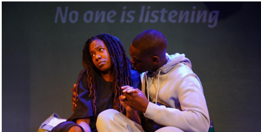
...blackbird hour, 2025.

...blackbird hour made its world premiere at the Bush Theatre, and was produced in association with them and went on to tour to Bristol Old Vic.