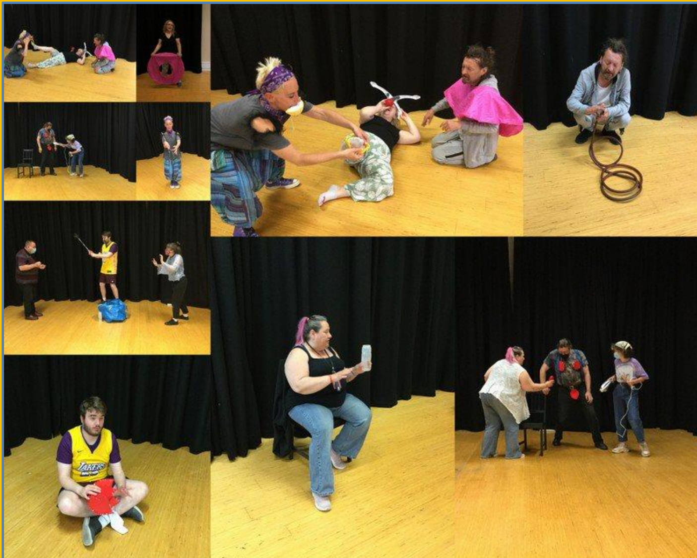
In the Moment in rehearsal at York St. John University