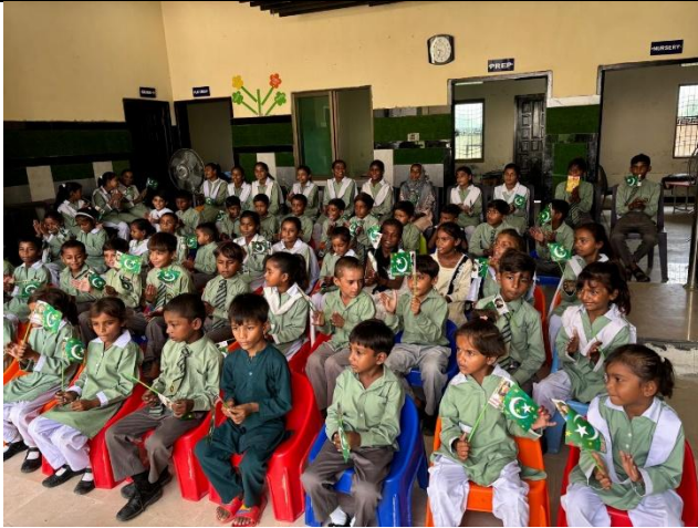
Pakistan Day Celebration