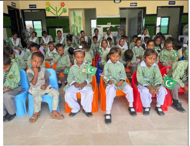
Saying Prayers on Pakistan Day