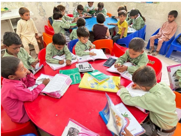
Enjoying being in class