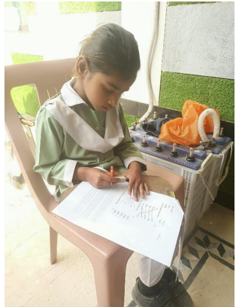
Such concentration from youngsters