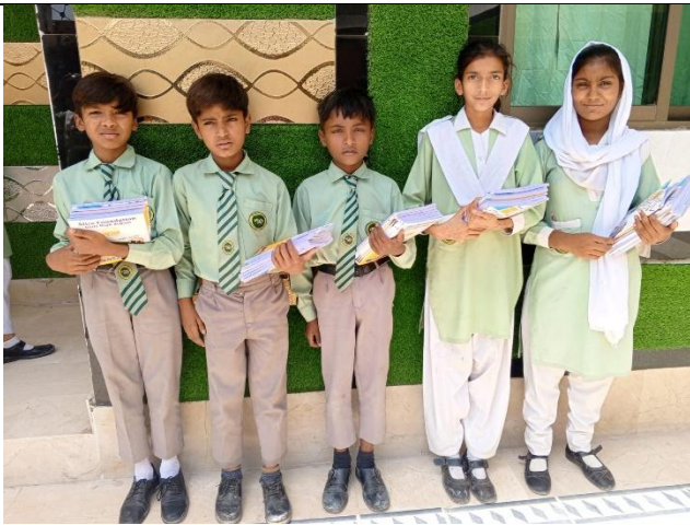
Presentation of new books, to every child, for reading and for writing.