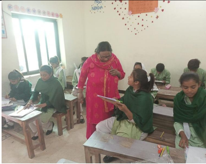
Older pupils in class