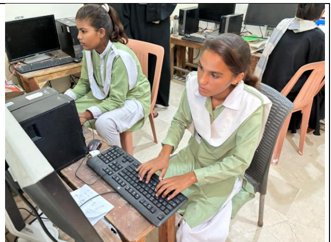
Older girls on the computers