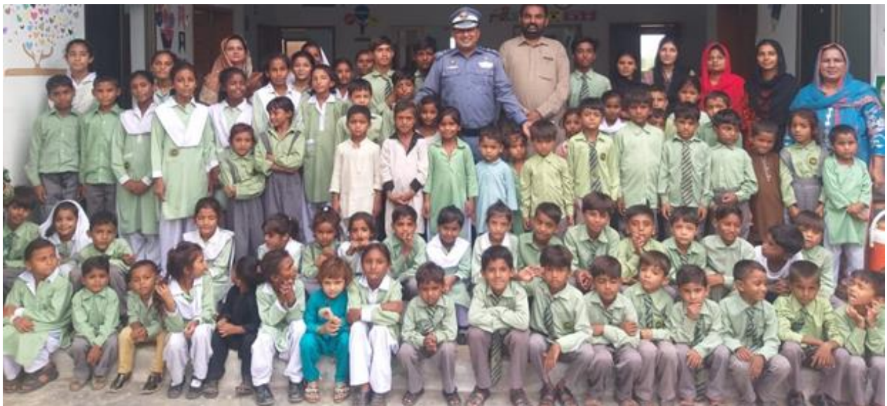
The successful students looking so smart in their school uniform.

Congratulations! The end of year results were very good and all students were able to progress to the next class. Well done. Iven was particularly struck by how quickly the young people had taken on board the behaviours, manners and attitudes required for school life.