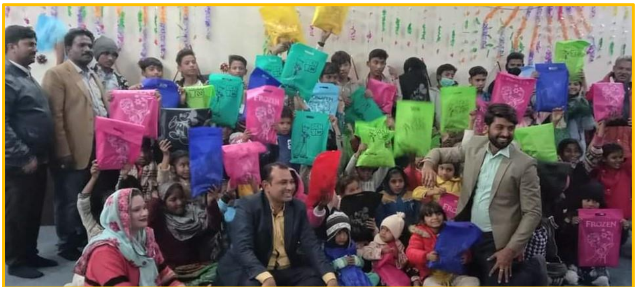
Christmas gifts for the children thanks to The Alice Foundation